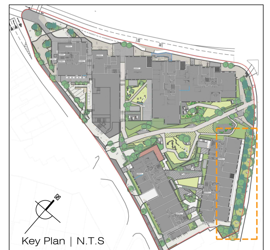
Key Plan | N.T.S.