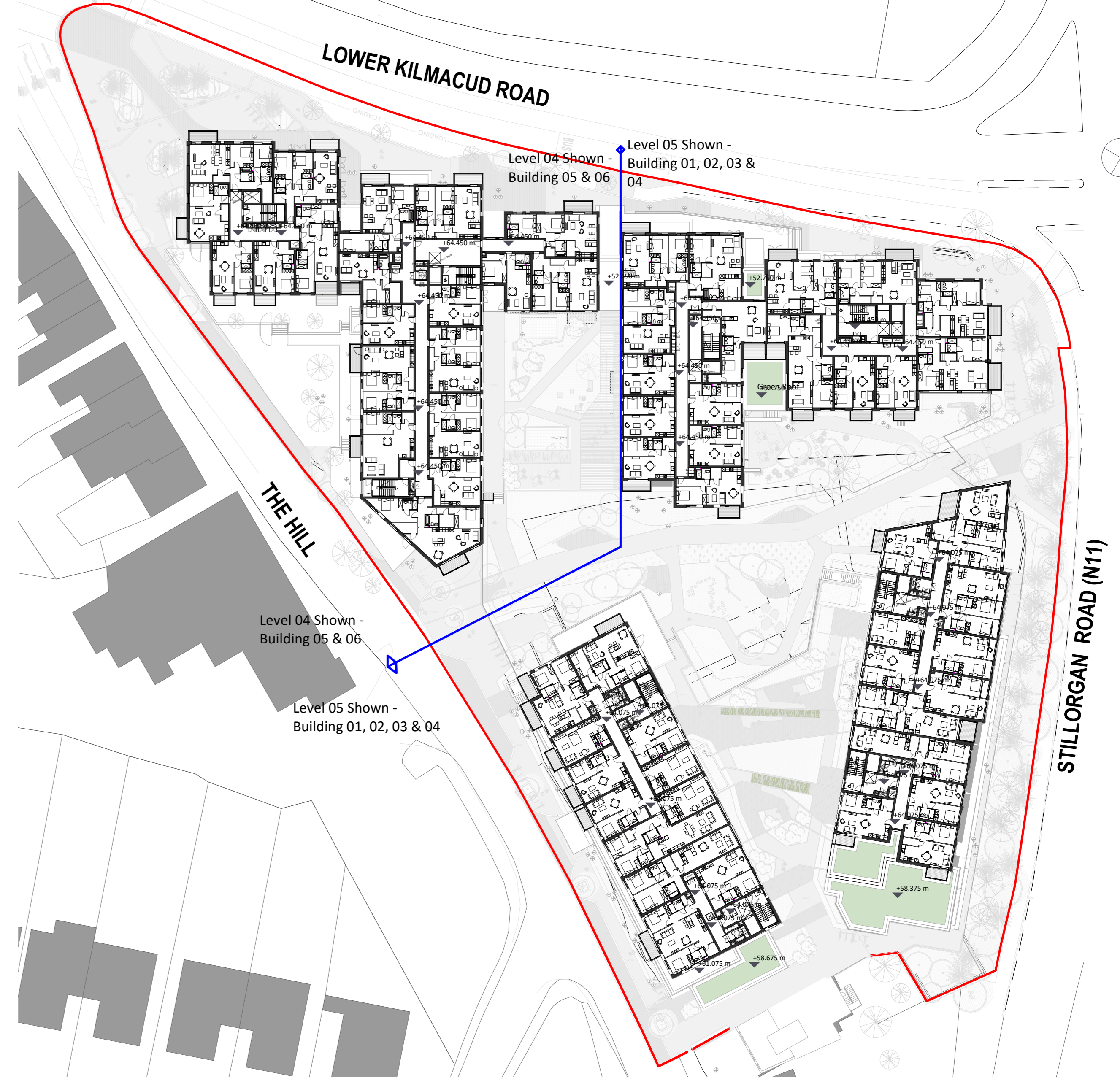
⑥ - Level 04/05 (Part V Units) 1:500