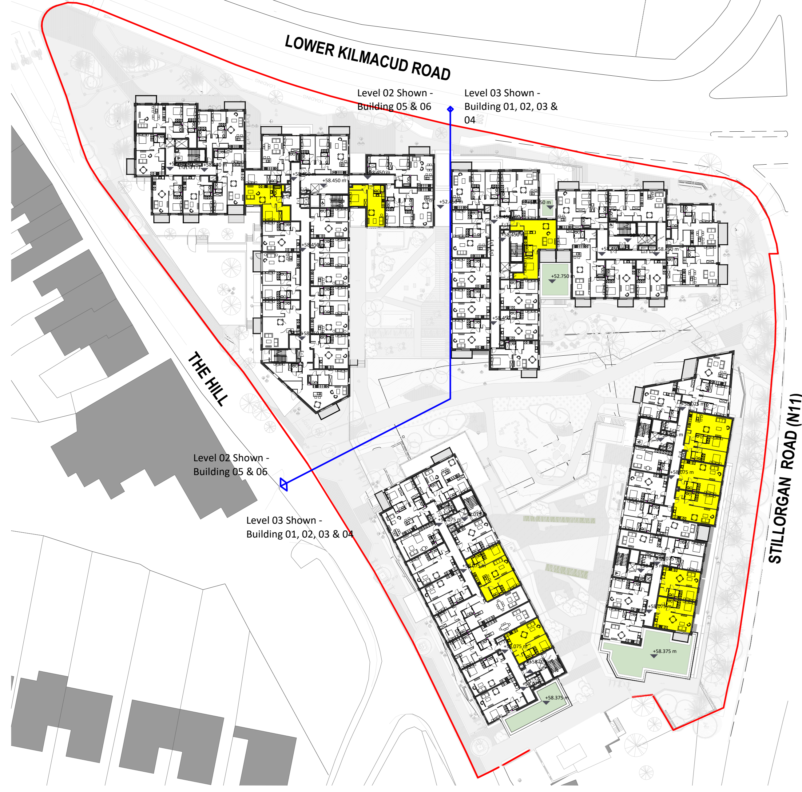
④ - Level 02/03 (Part V Units) 1:500