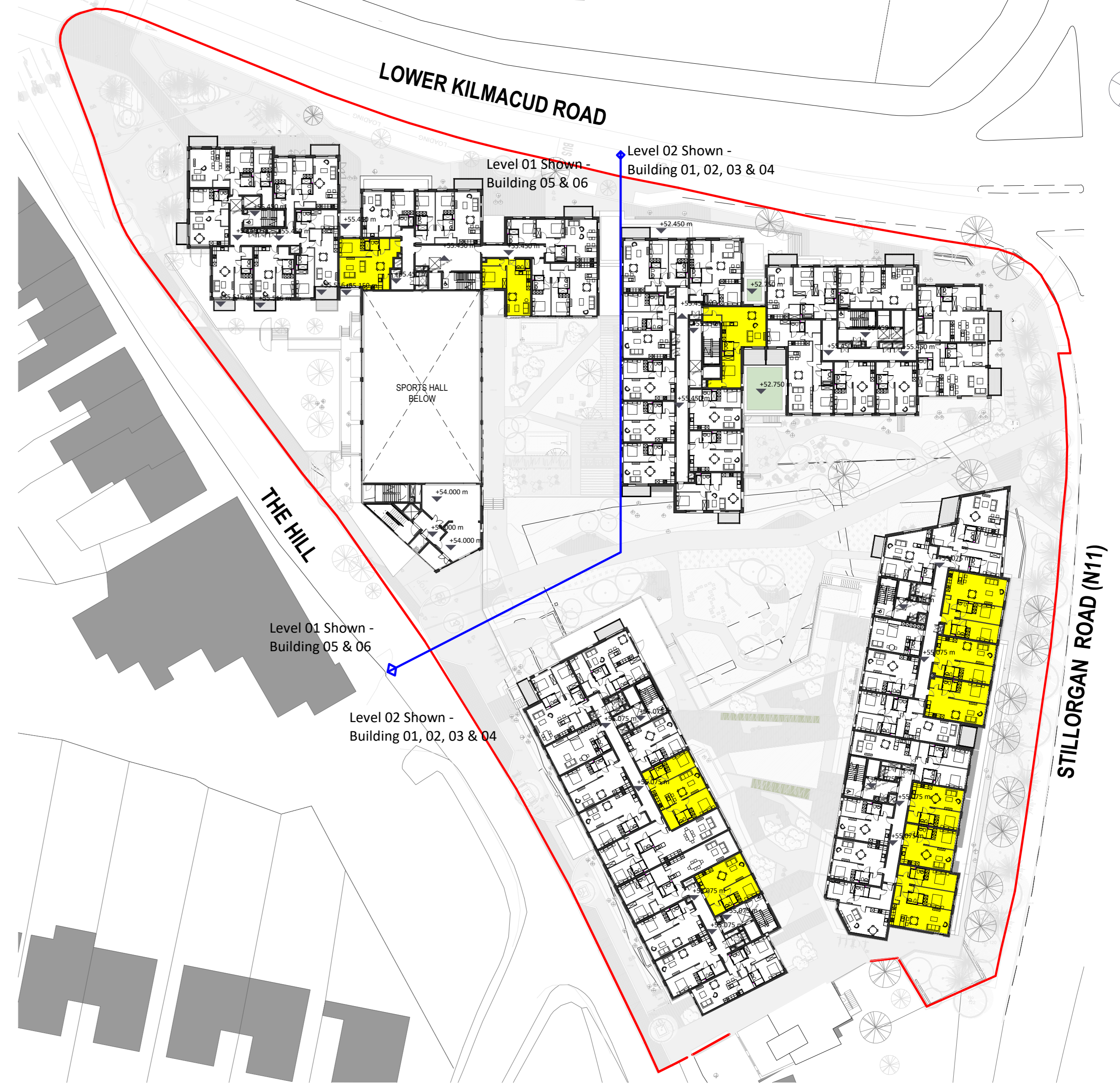
③ - Level 01/02 (Part V Units) 1:500