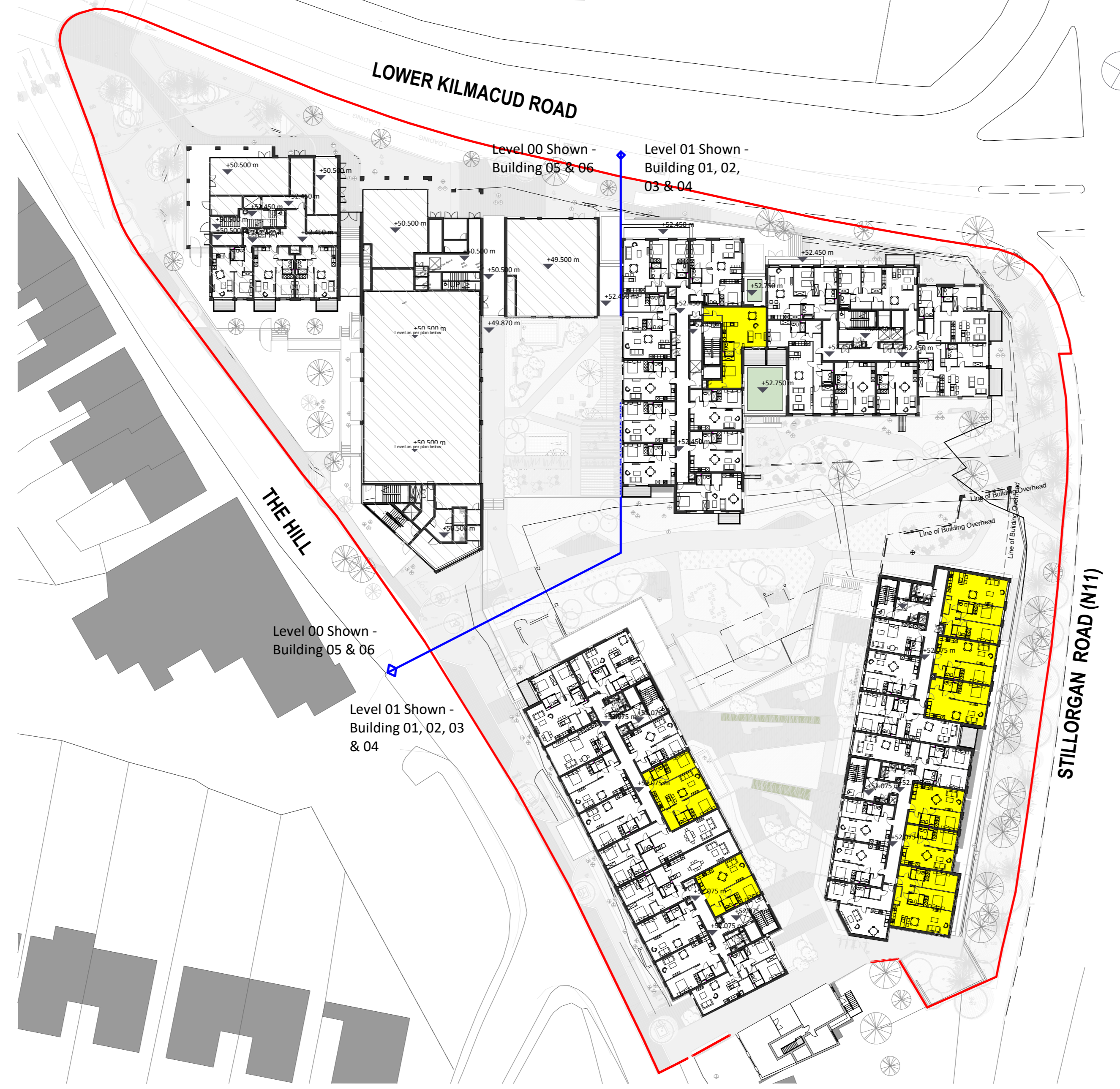
② - Level 01/01 (Part V Units) 1:500