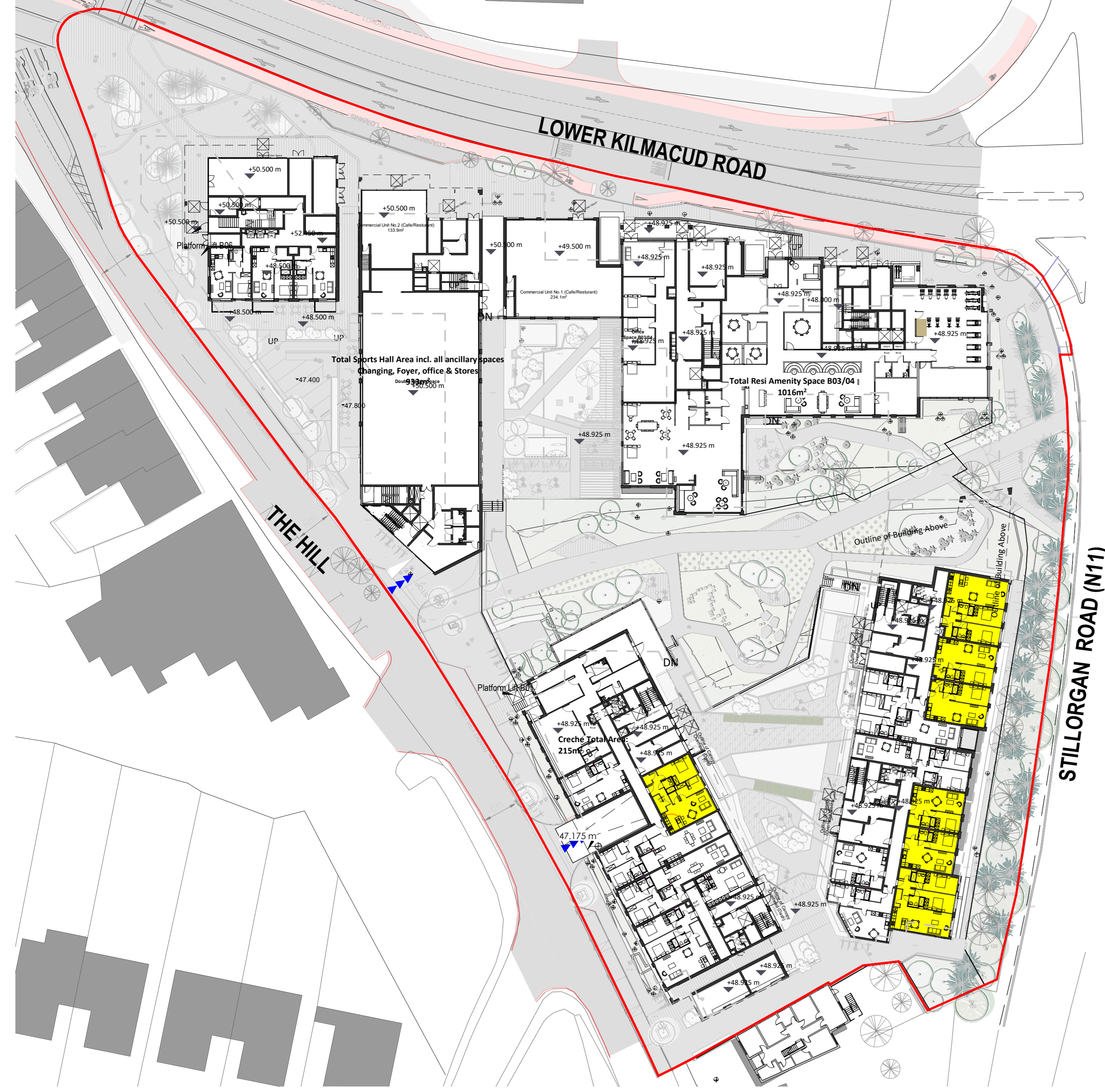
① - Level 00 (Part V Units) 1:500