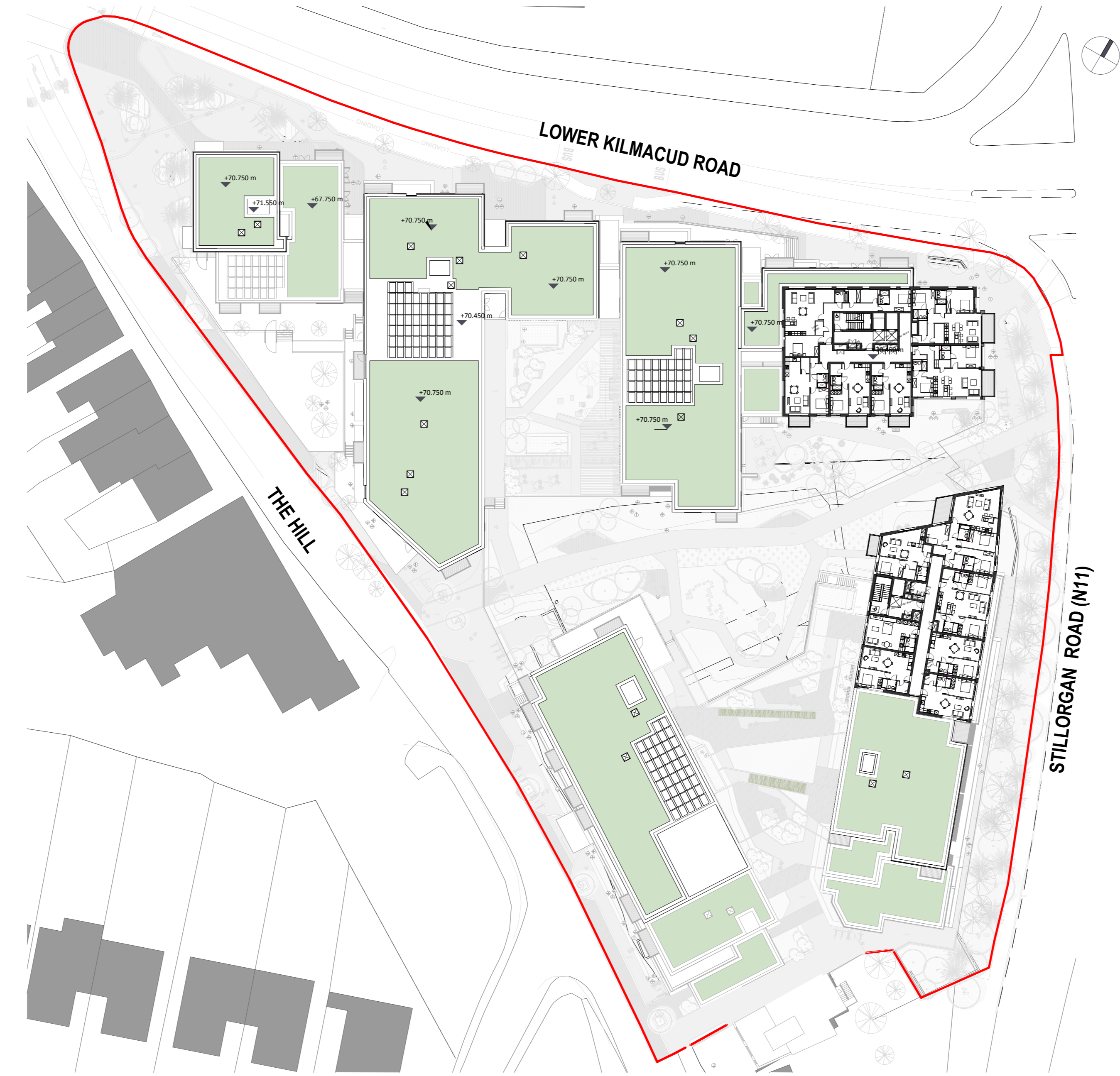
② 07 - Level 07 (Part V Units) 1:500