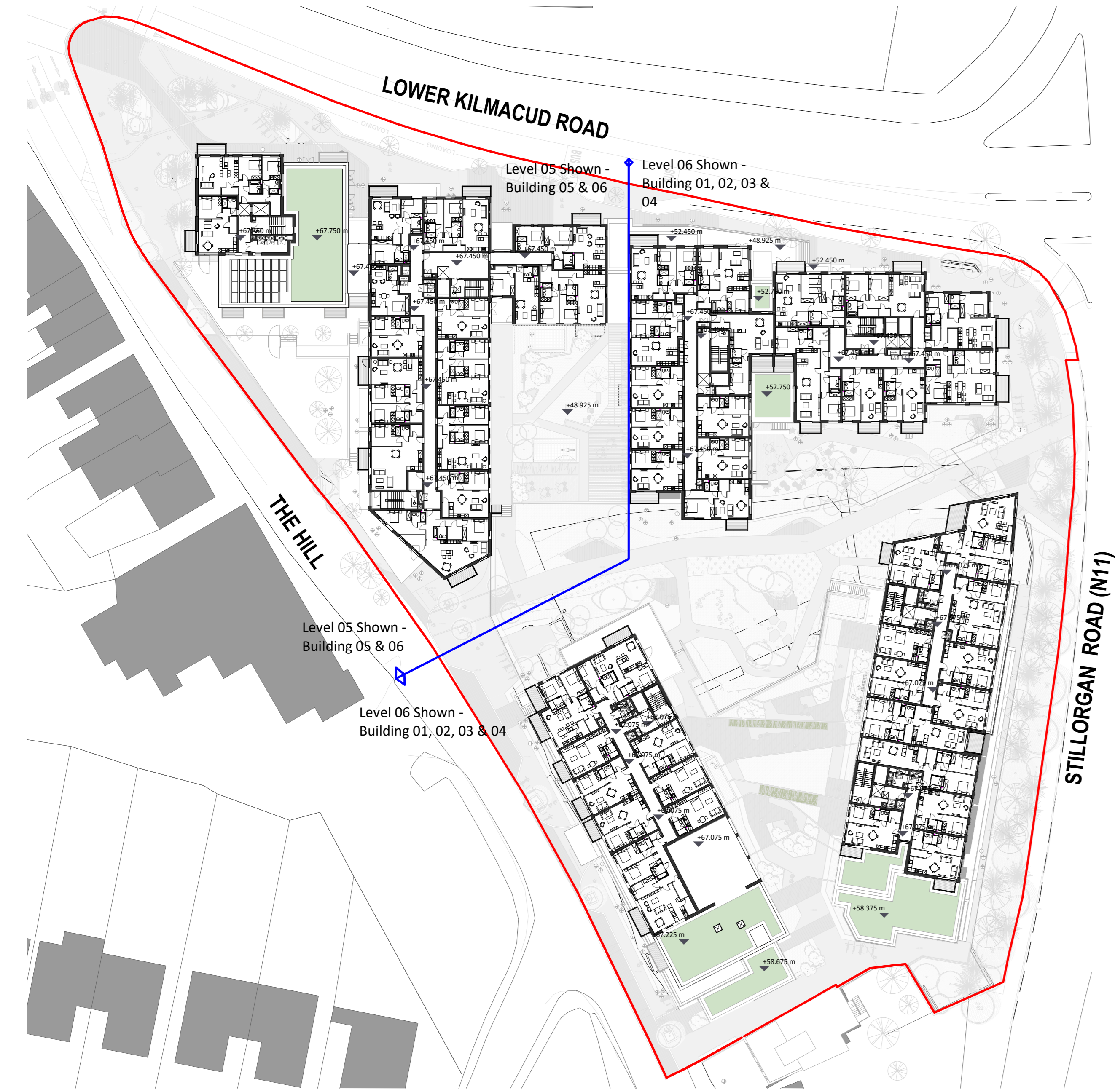
① 06 - Level 05/06 (Part V Units) 1:500