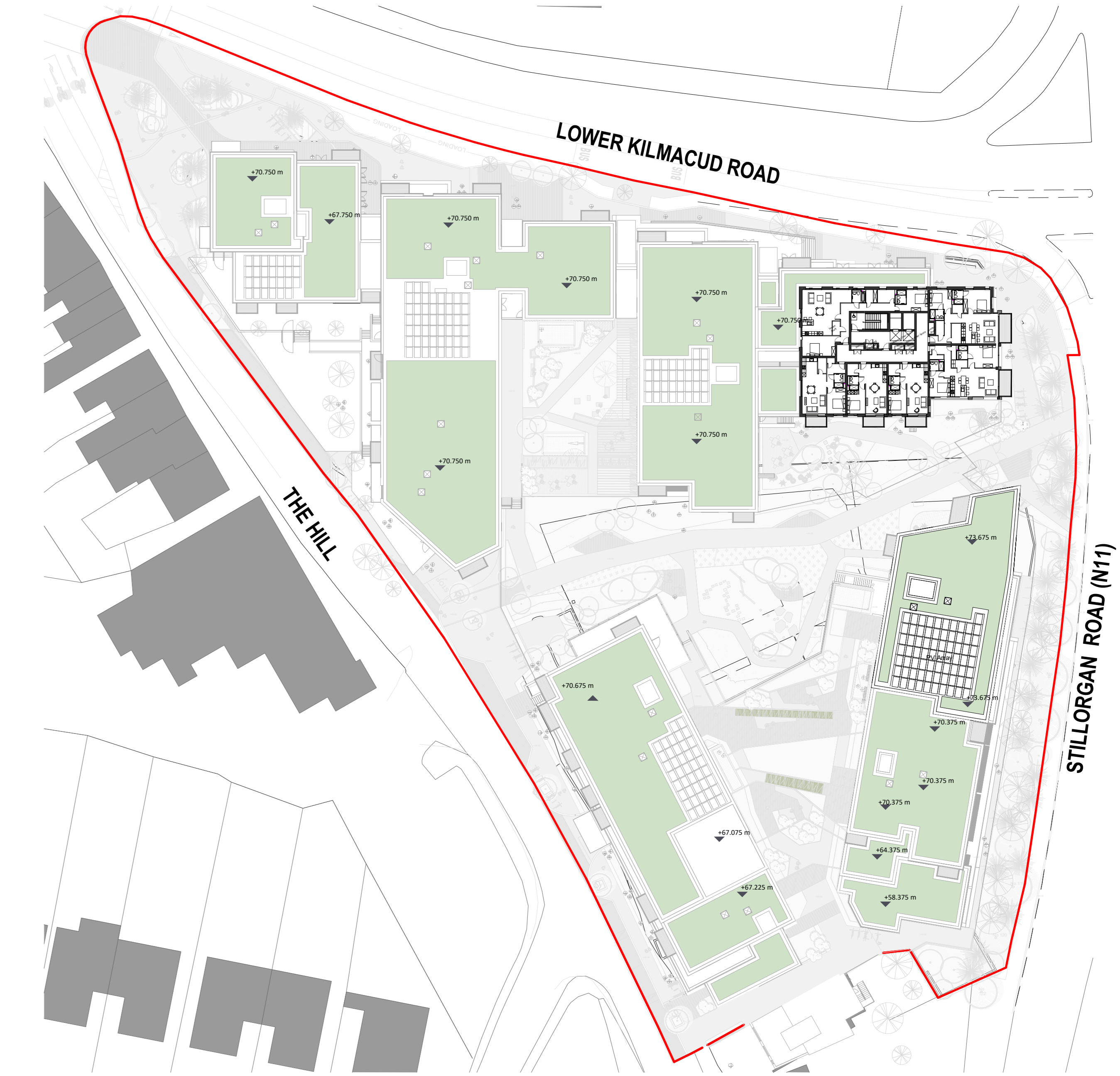
③ 08 - Level 08 (Part V Units) 1:500