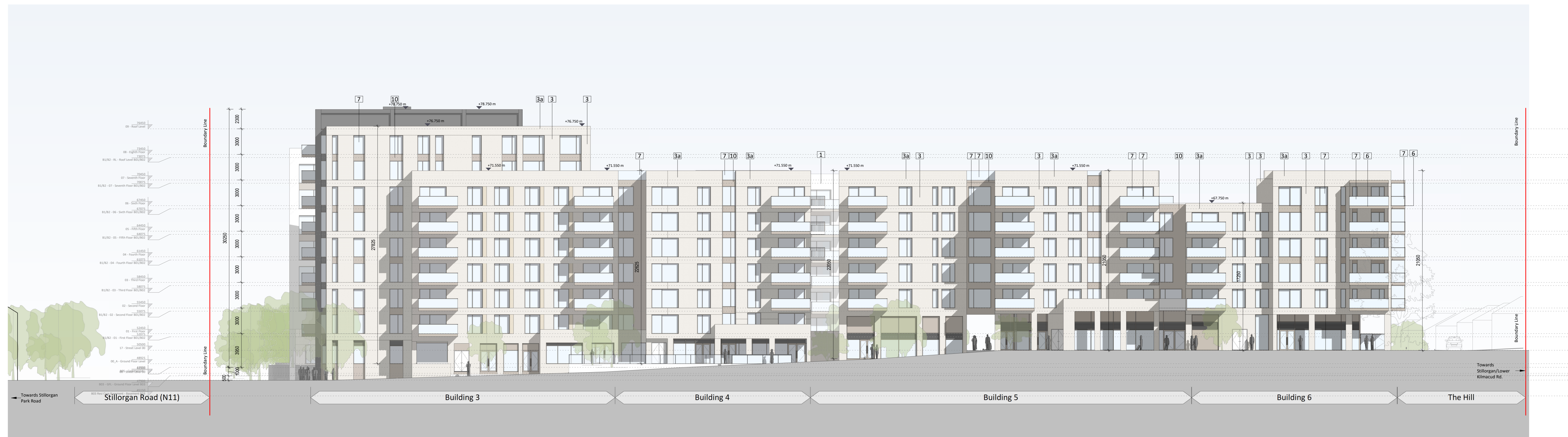
1) Site Context - Kilmacud Road - North Elevation 1:200