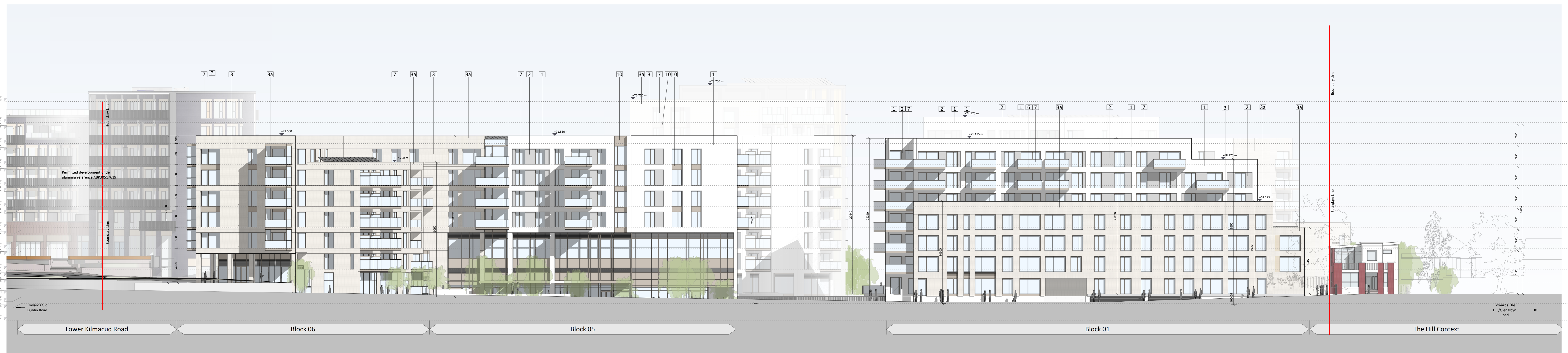
2b) Site Context - (The Hill) - West Elevation 1:200