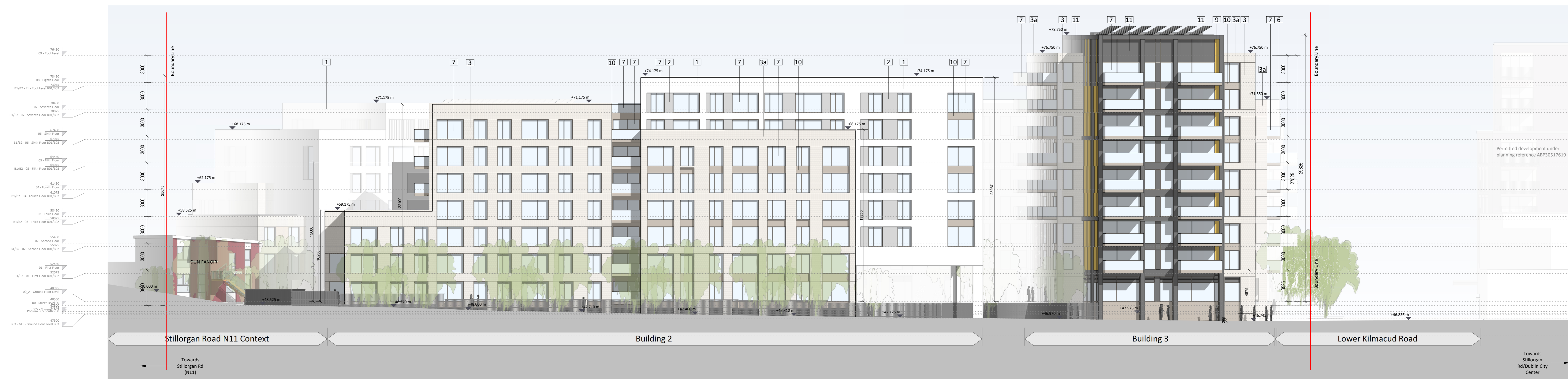
3 Site Context - Stillorgan Rd (N11) - East Elevation 1:200