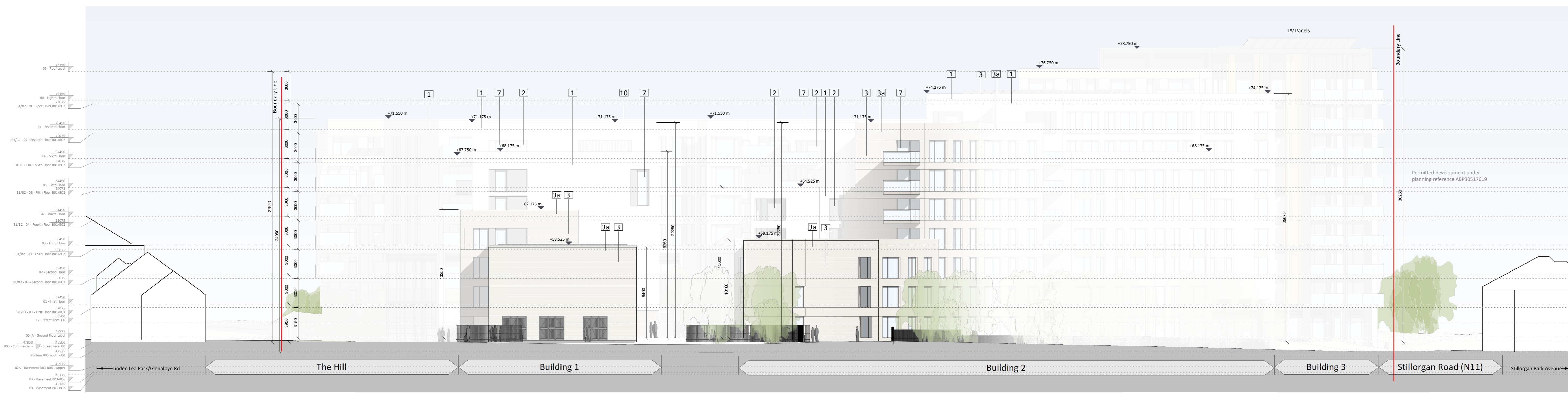
1 Site Context - Southern Elevation 1:200