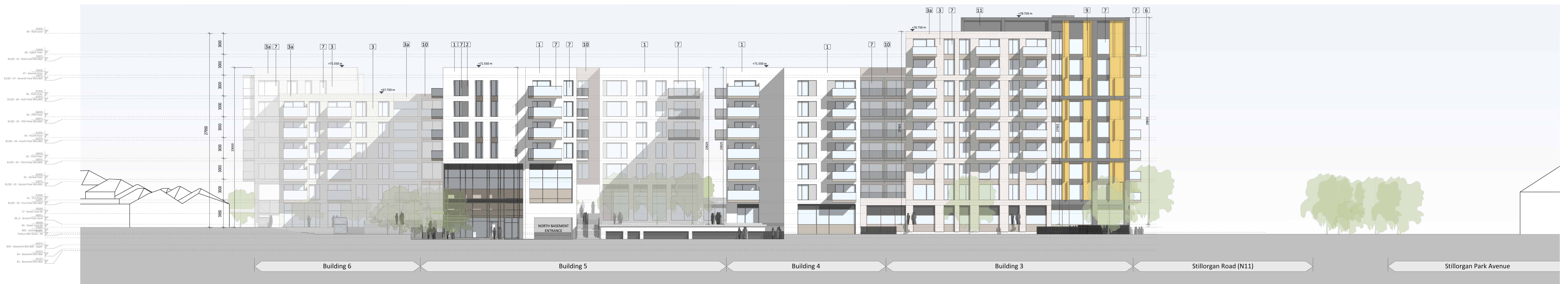
2 Courtyard Elevation B03-06 1:200