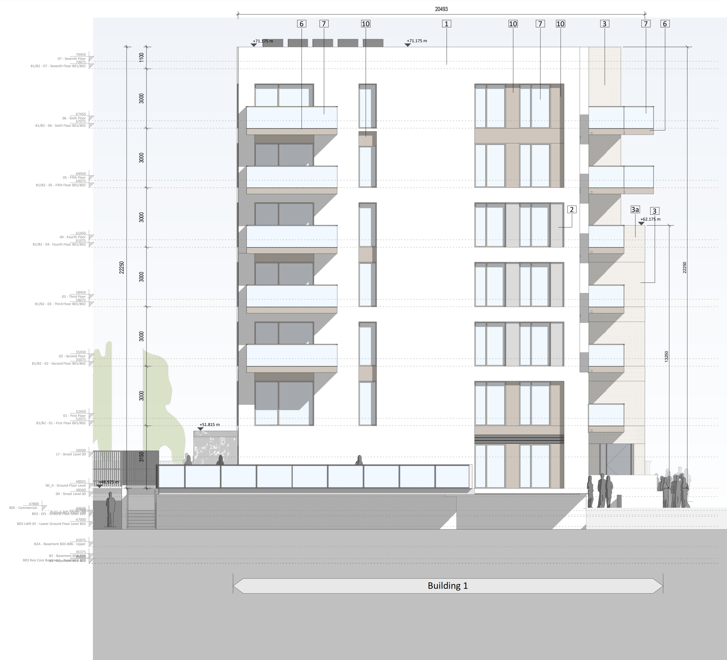
1 Building 01 - NW Elevation 1:100