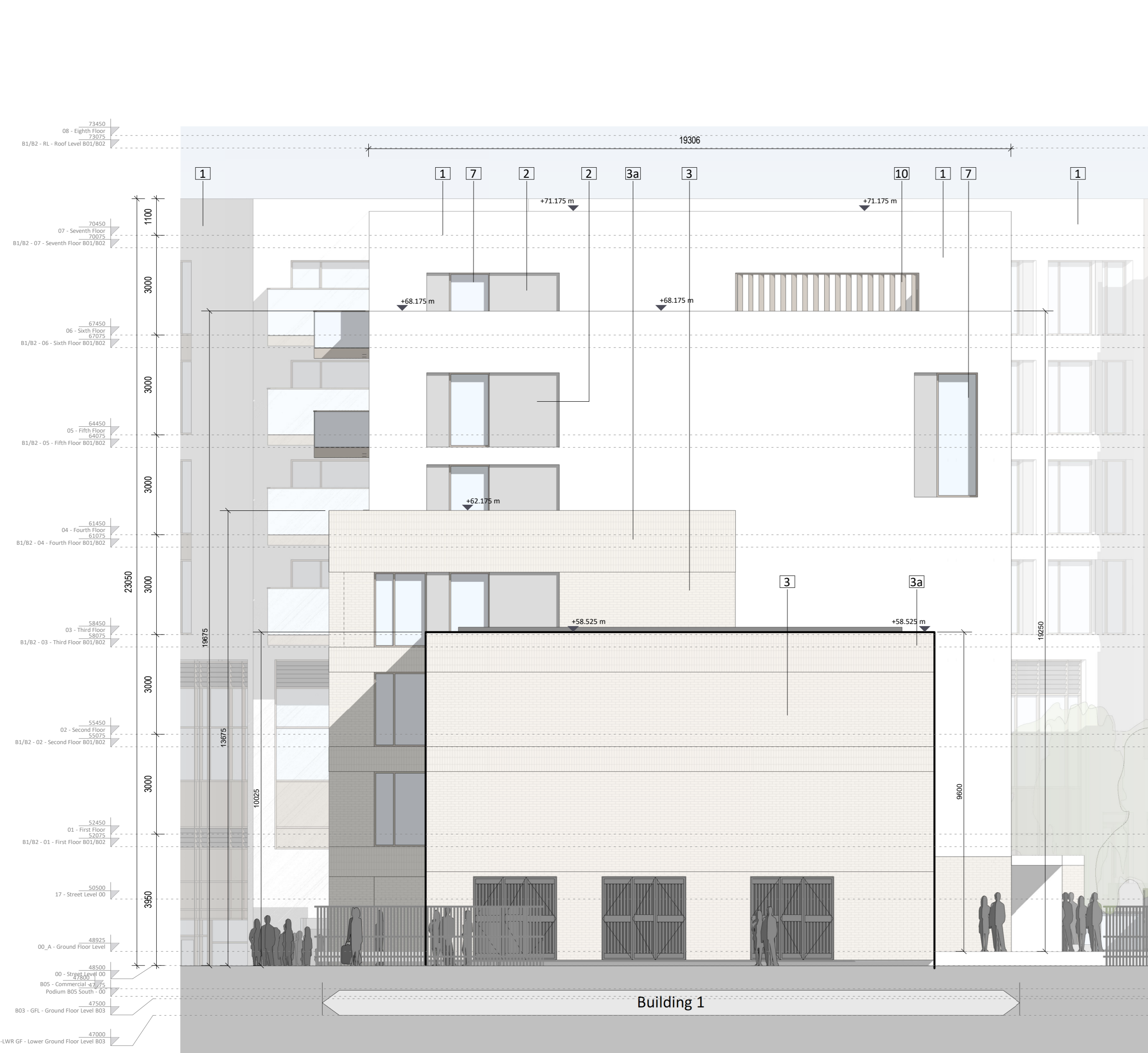
2 Building 01 - SE Elevation 1:100