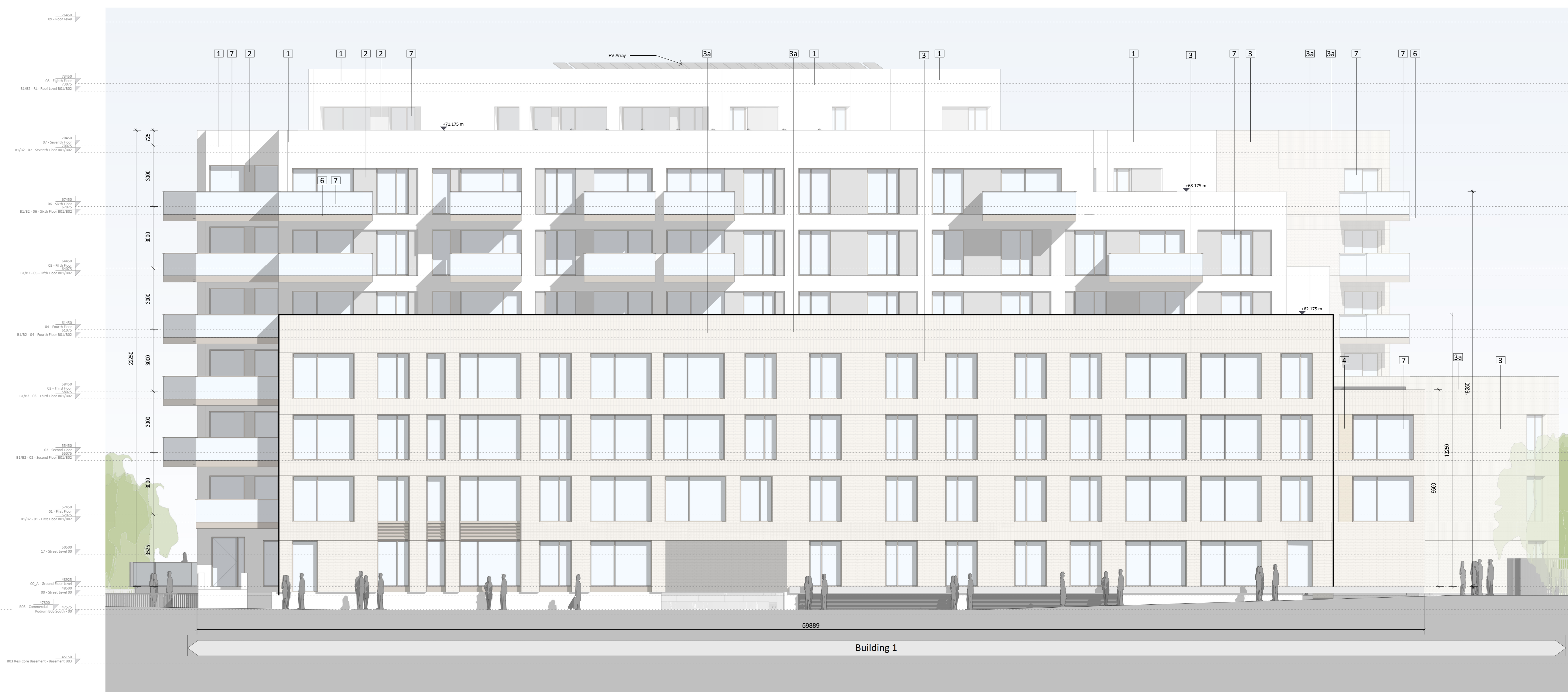
4 Elevation 02 - Building 01 - The Hill - NW Elevation 1:100