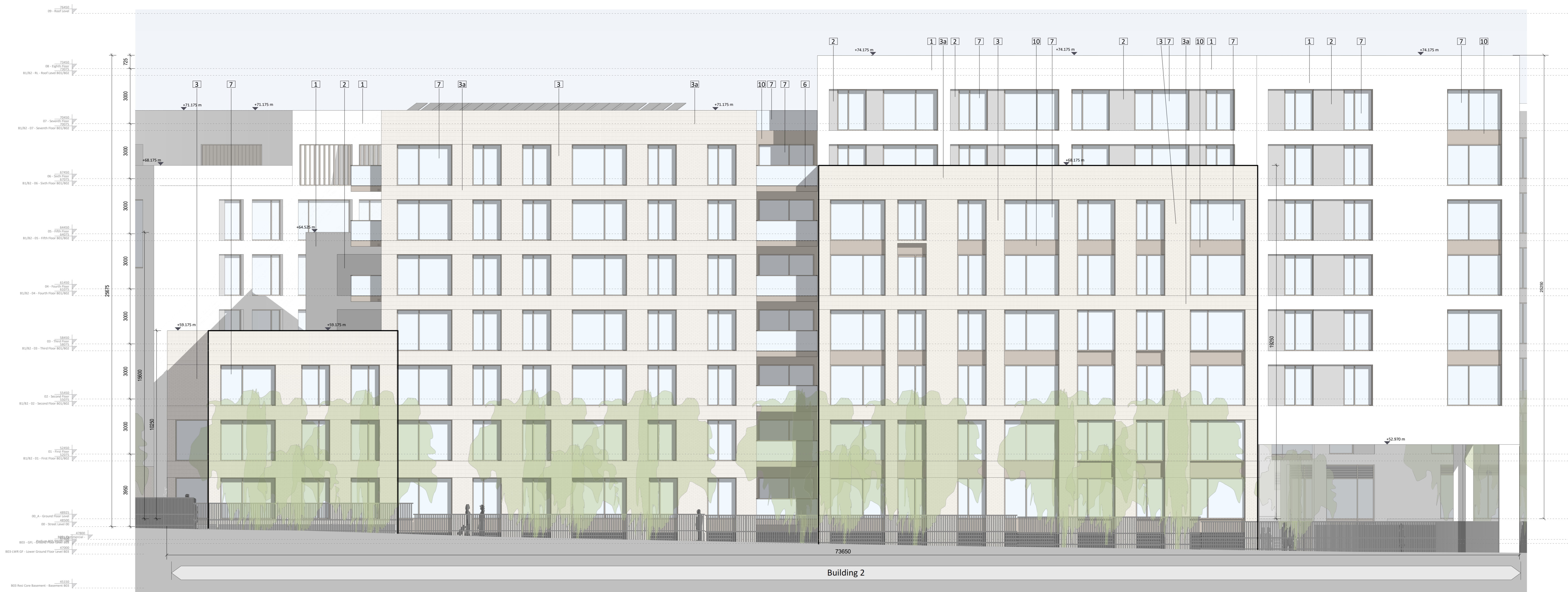
③ Building 02 NE Elevation Stillorgan Road 1:100