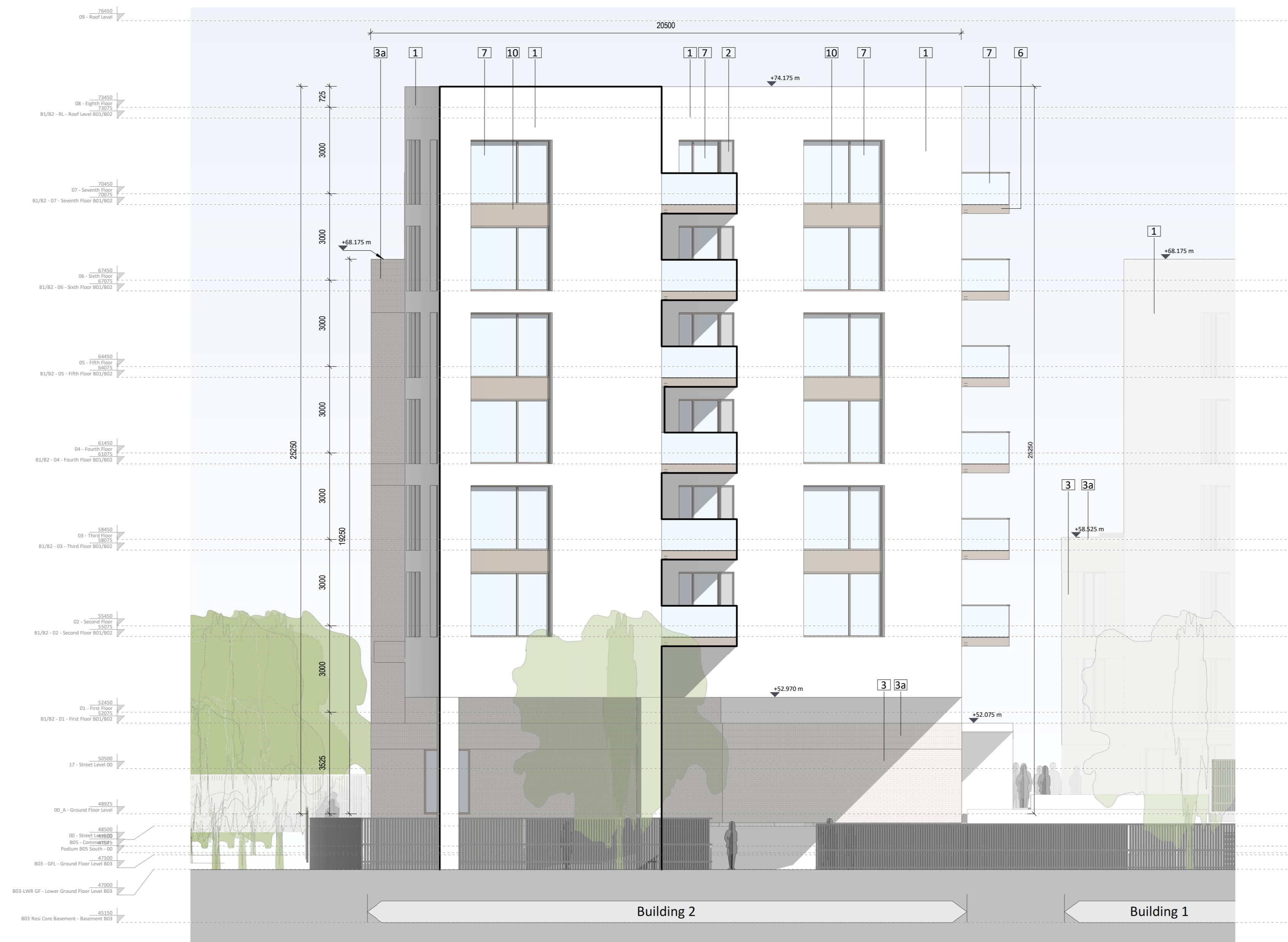
① Building 02 - NW Elevation 1:100