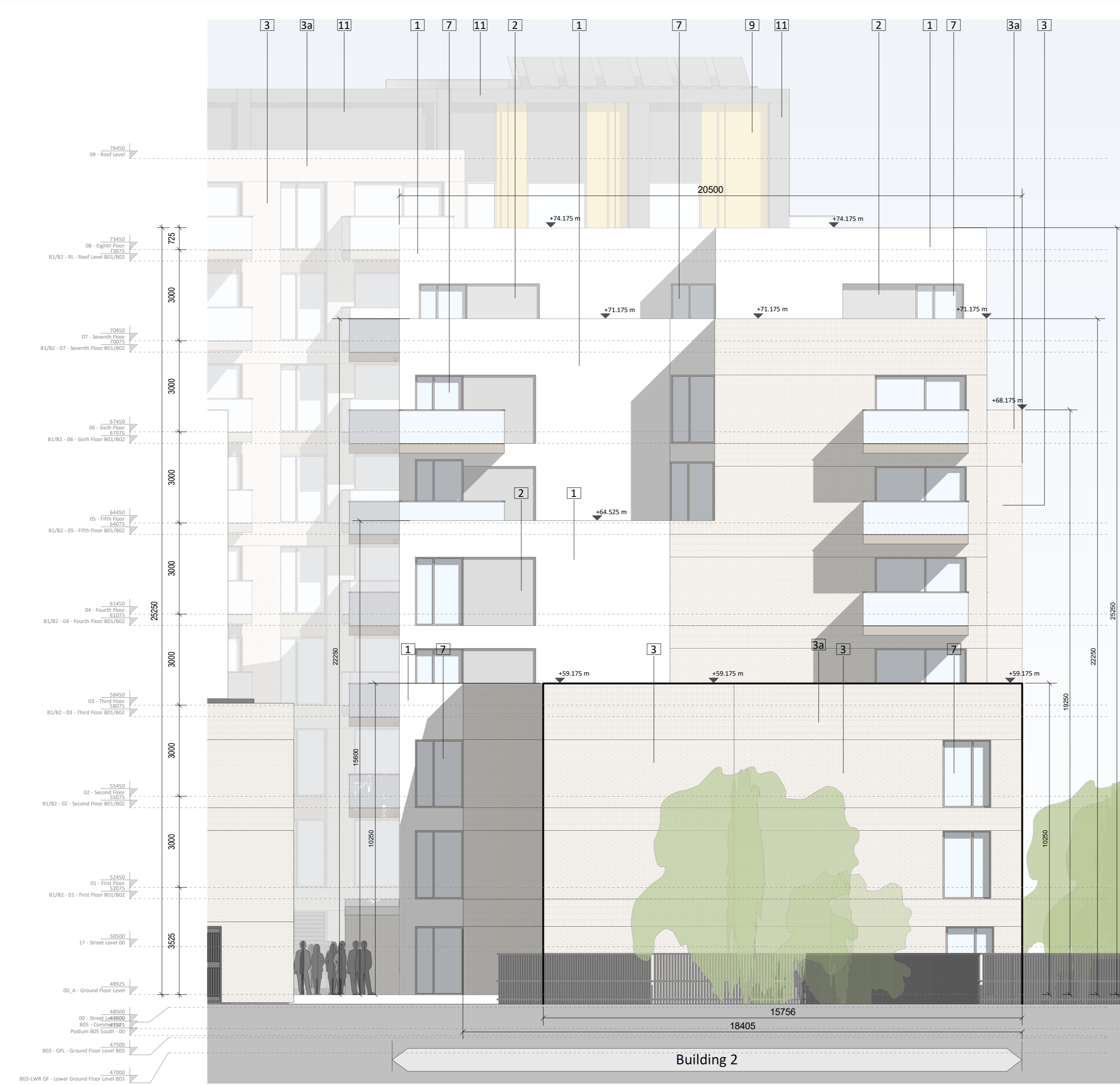
① Building 02 - SE Elevation 1:100