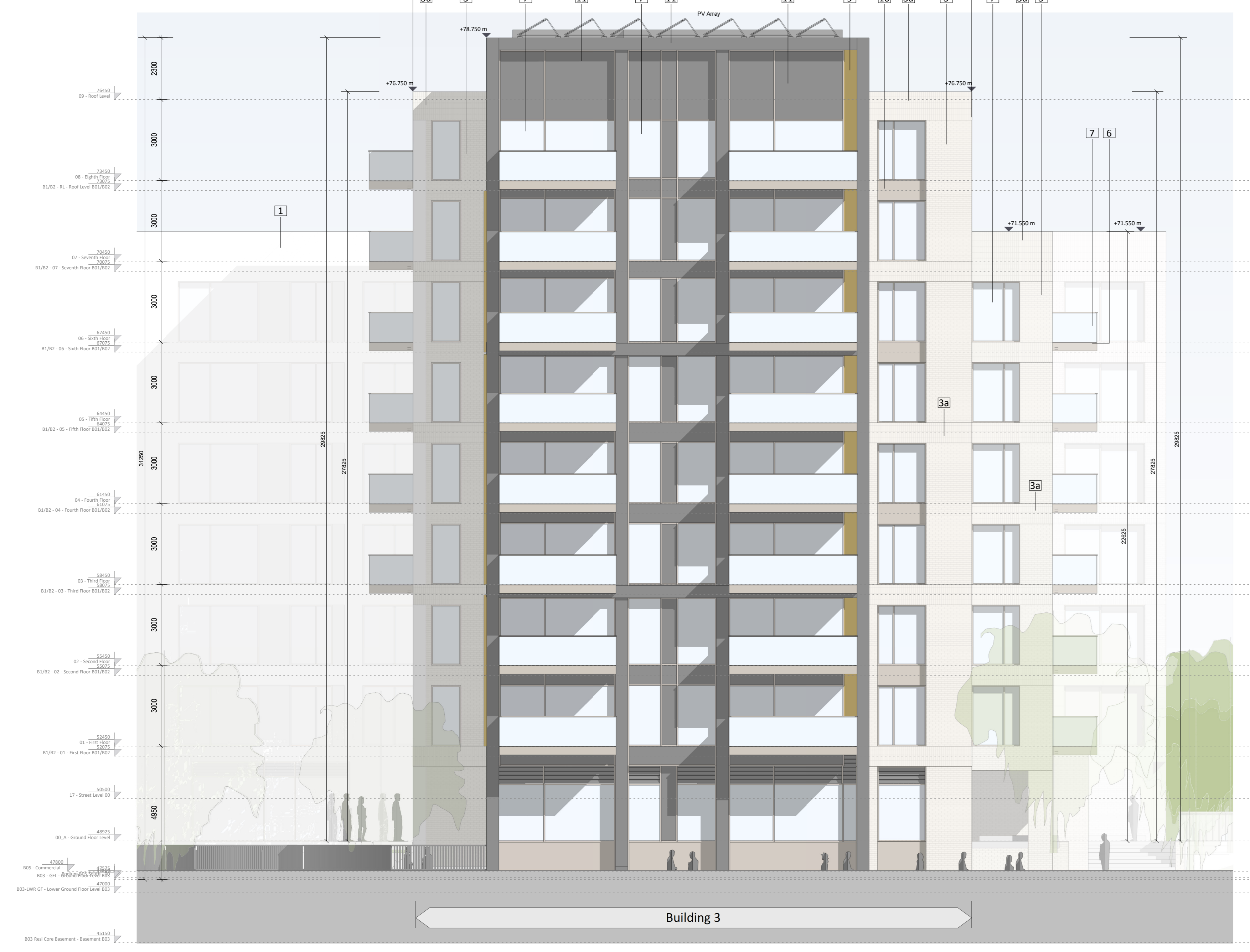
1 Building 03 - NE Elevation - Stillorgan Road 1:100