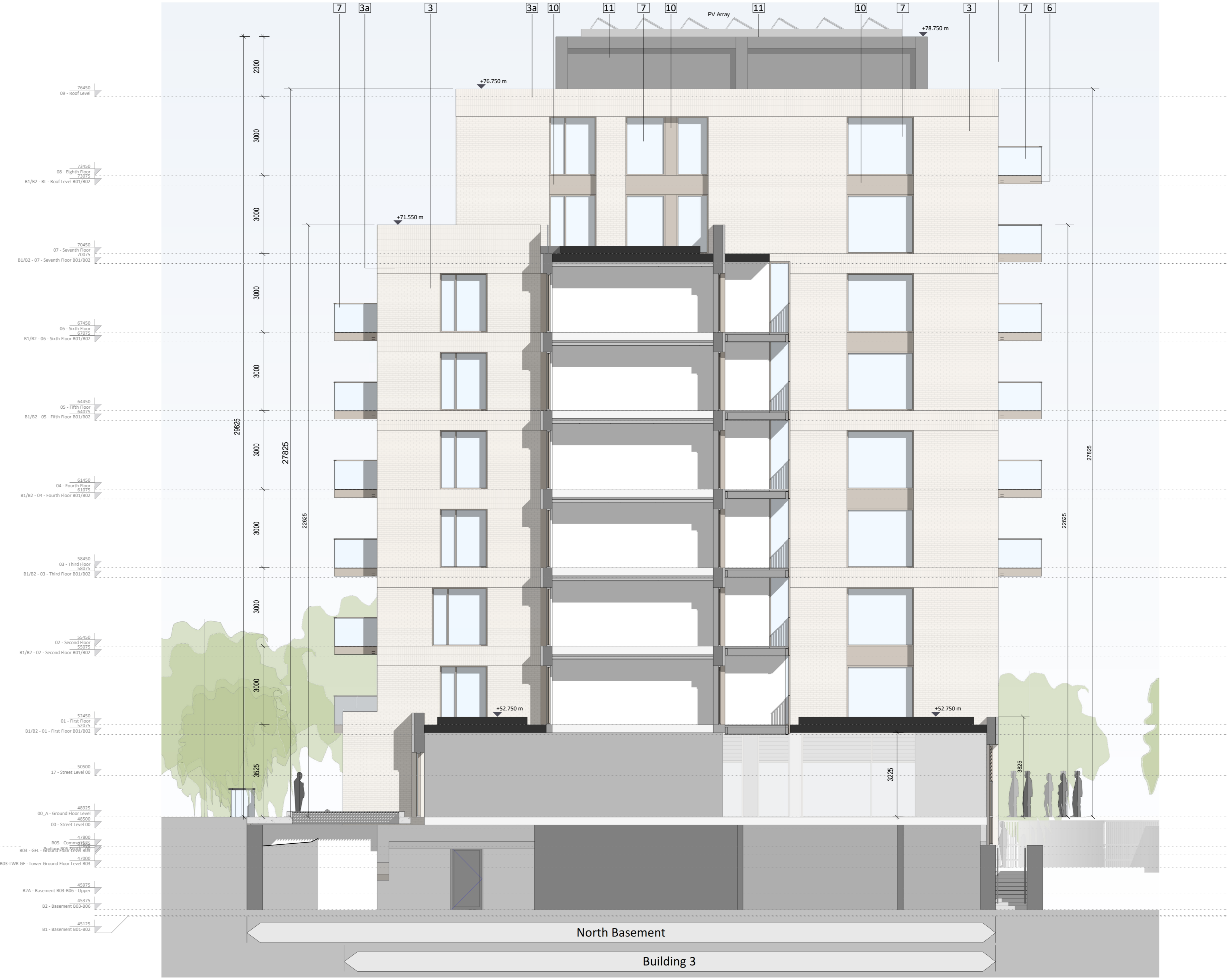
2 Building 03 - SW Elevation 1:100