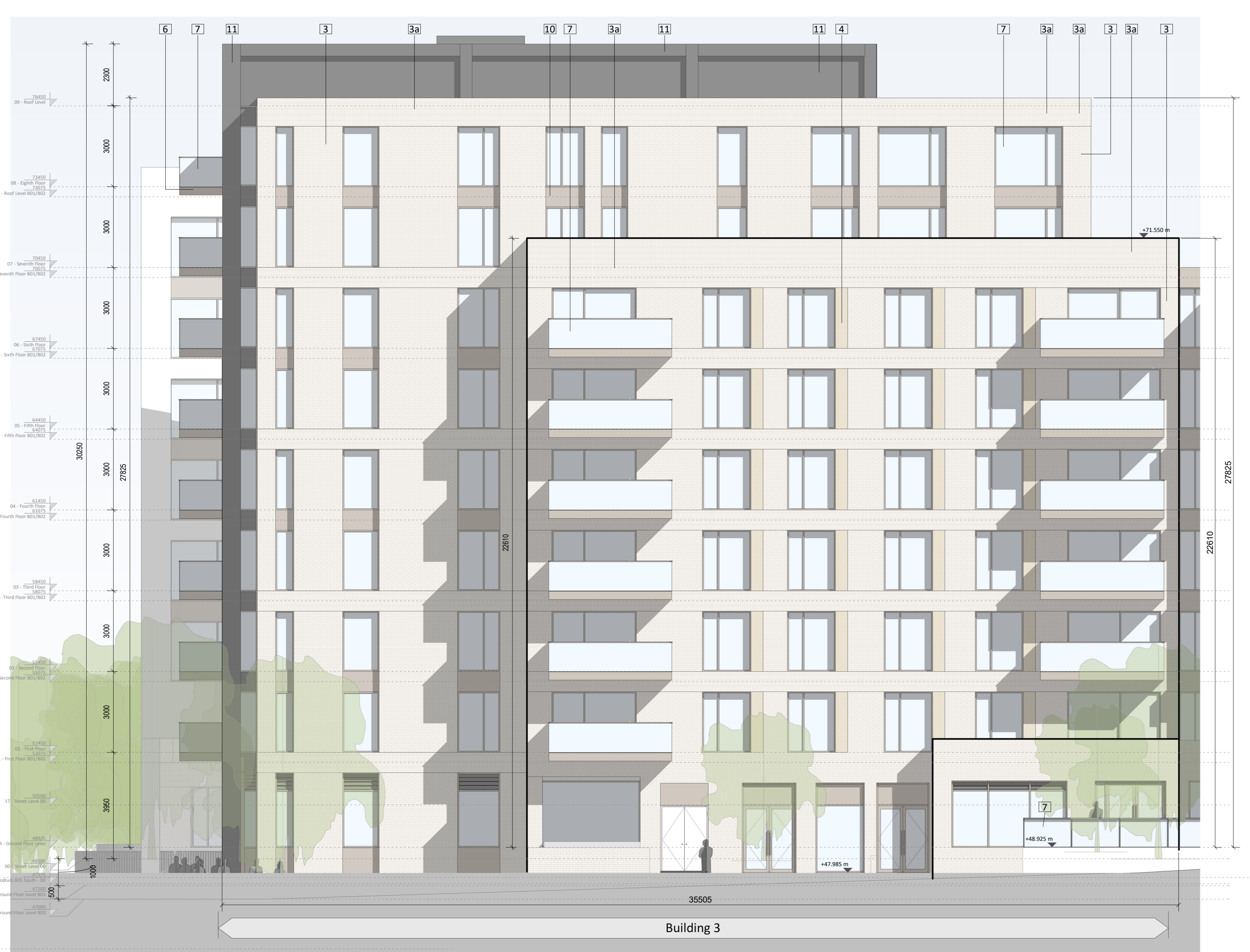
3 Building 03 - NW Elevation - Kilmacud Road 1:100