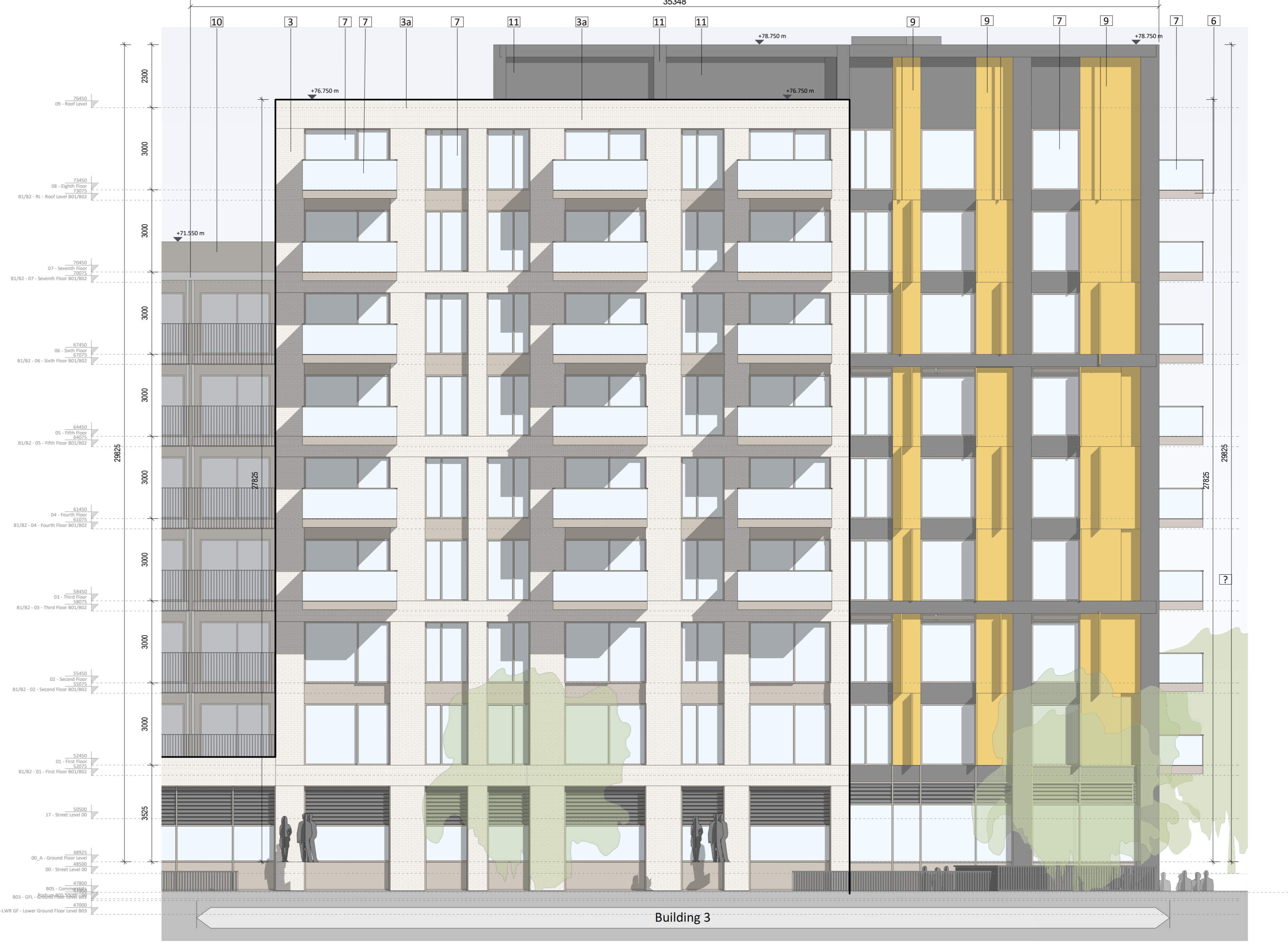
4 Building 03 - SE Elevation - Courtyard Elevation 1:100