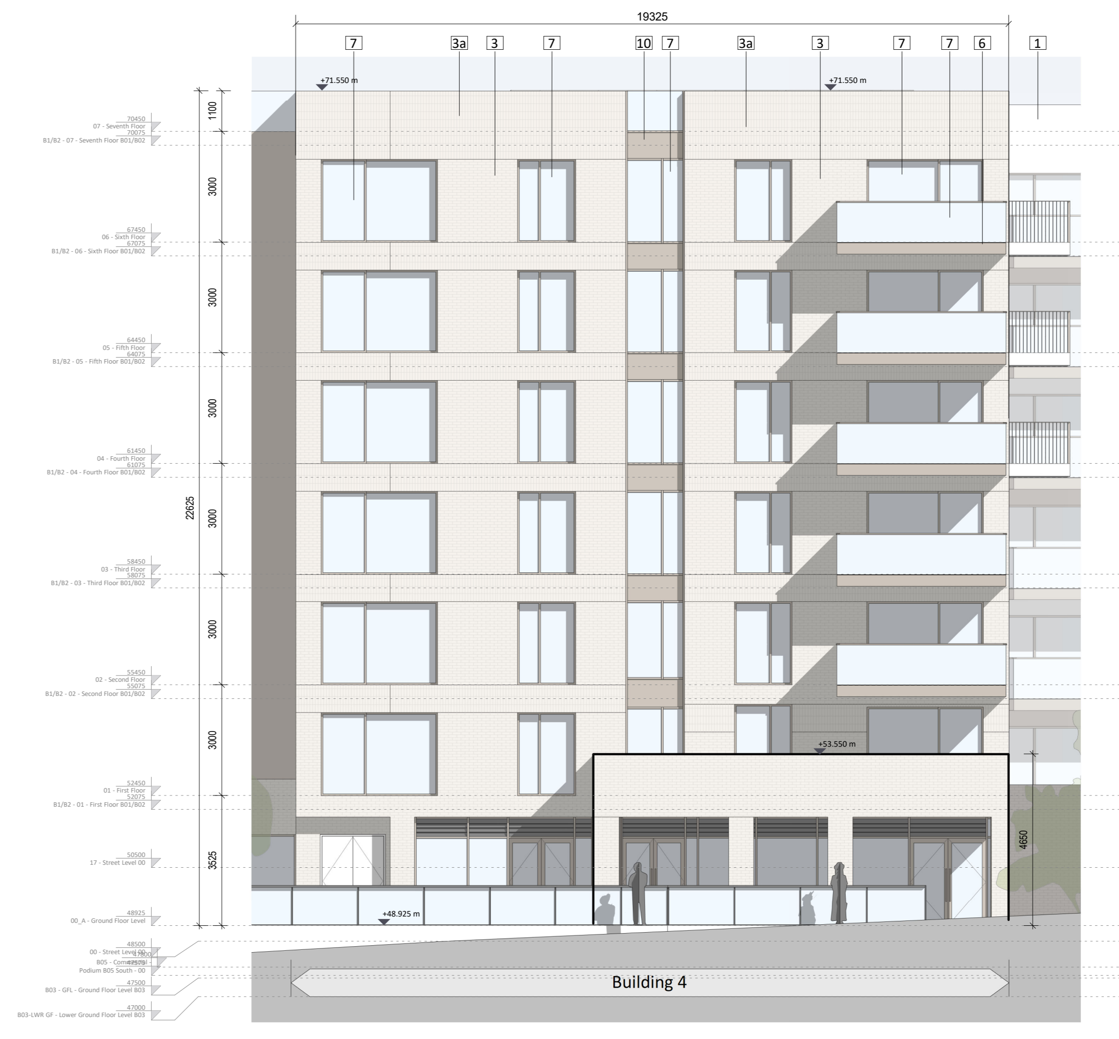
3 Building 04 - NW Elevation - Kilmacud Road 1:100