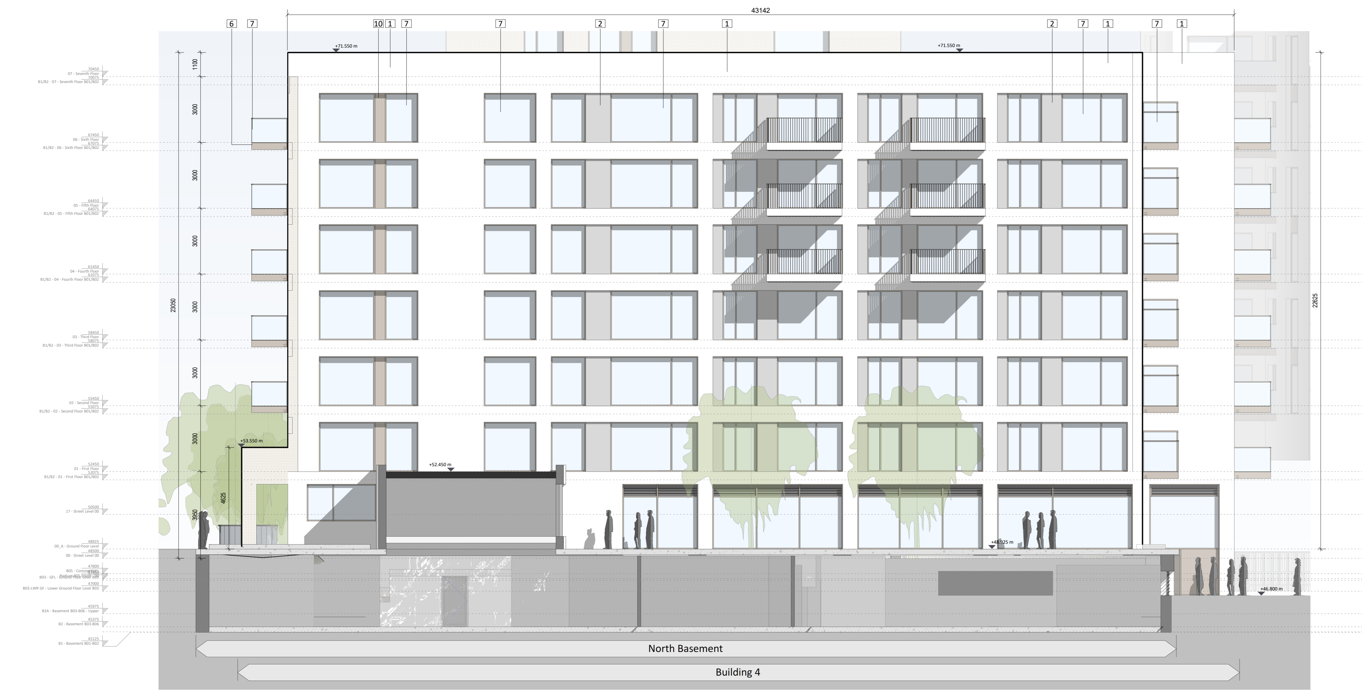
2 Building 04 - SW Elevation 1:100