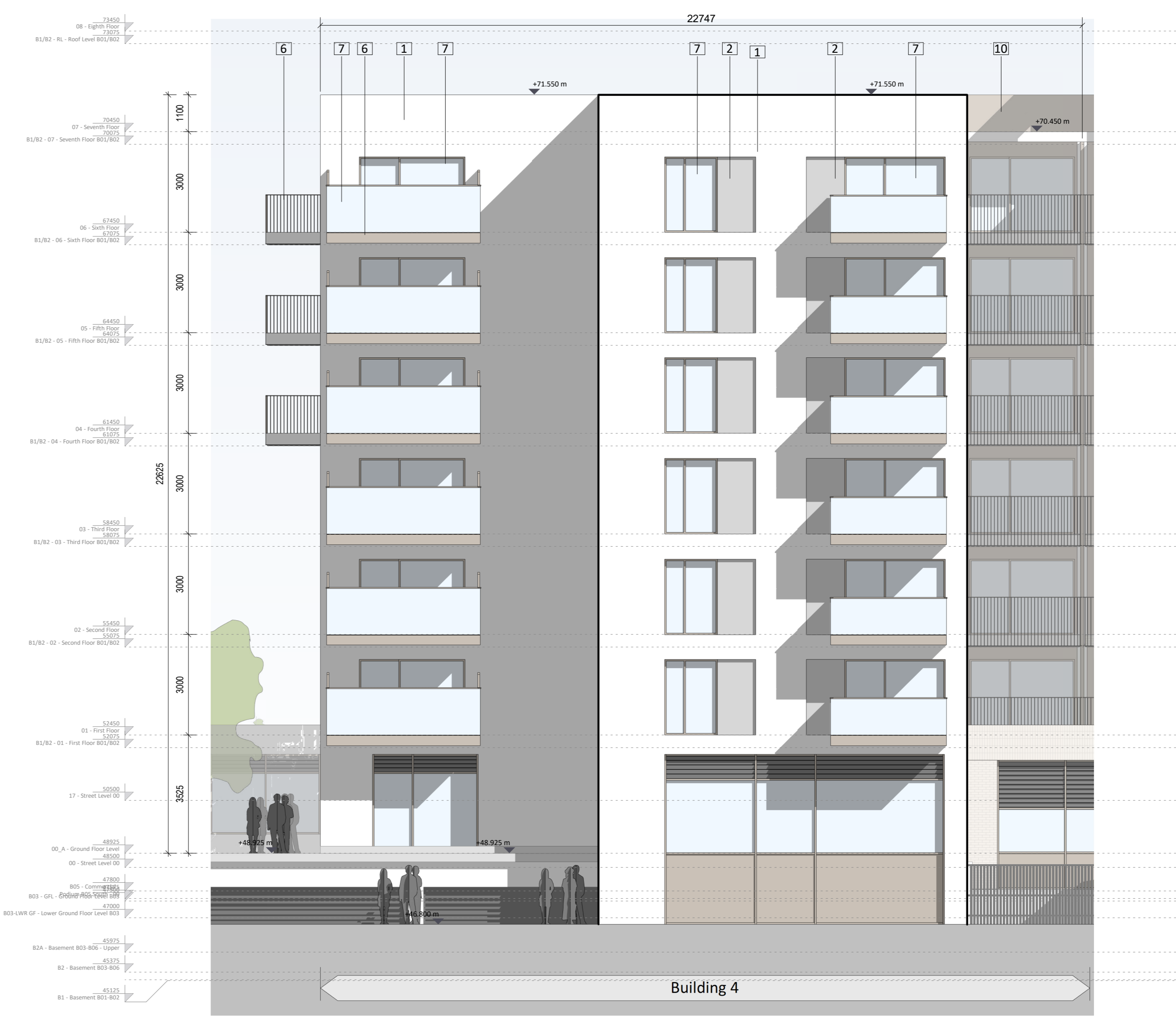
4 Building 04 - SE Elevation - Courtyard 1:100