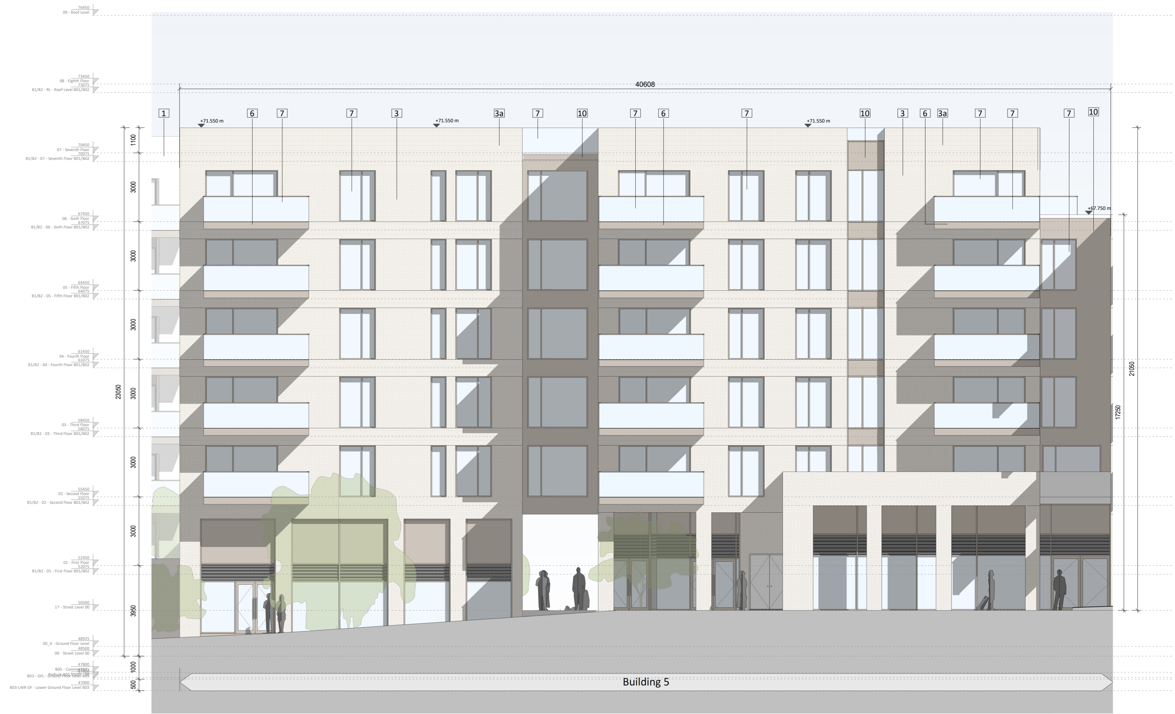
① Building 05 - NE Elevation - Kilmacud Road 1:100