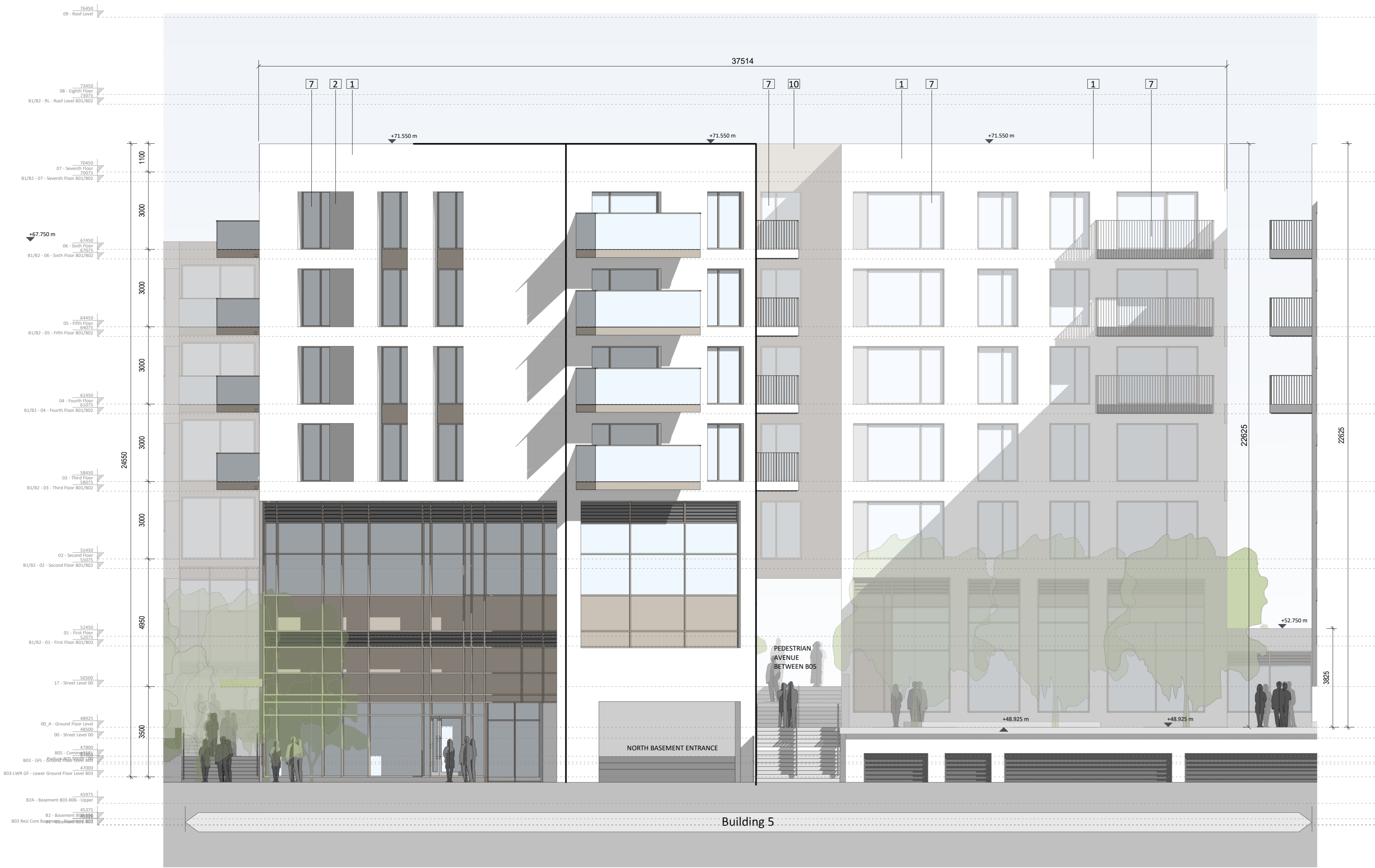
② Building 05 - SE Elevation - Courtyard Elevation 1:100