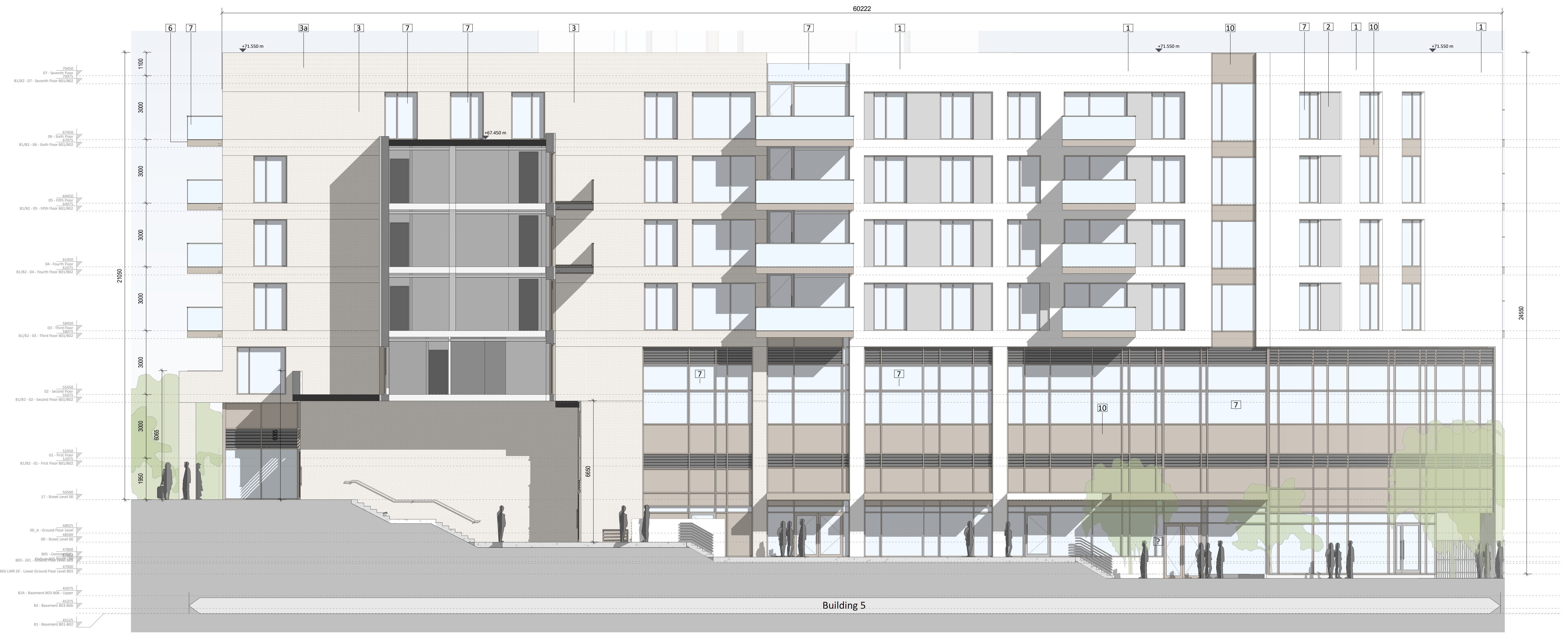
2 Building 05 - SW Elevation - Plaza Elevation 1:100