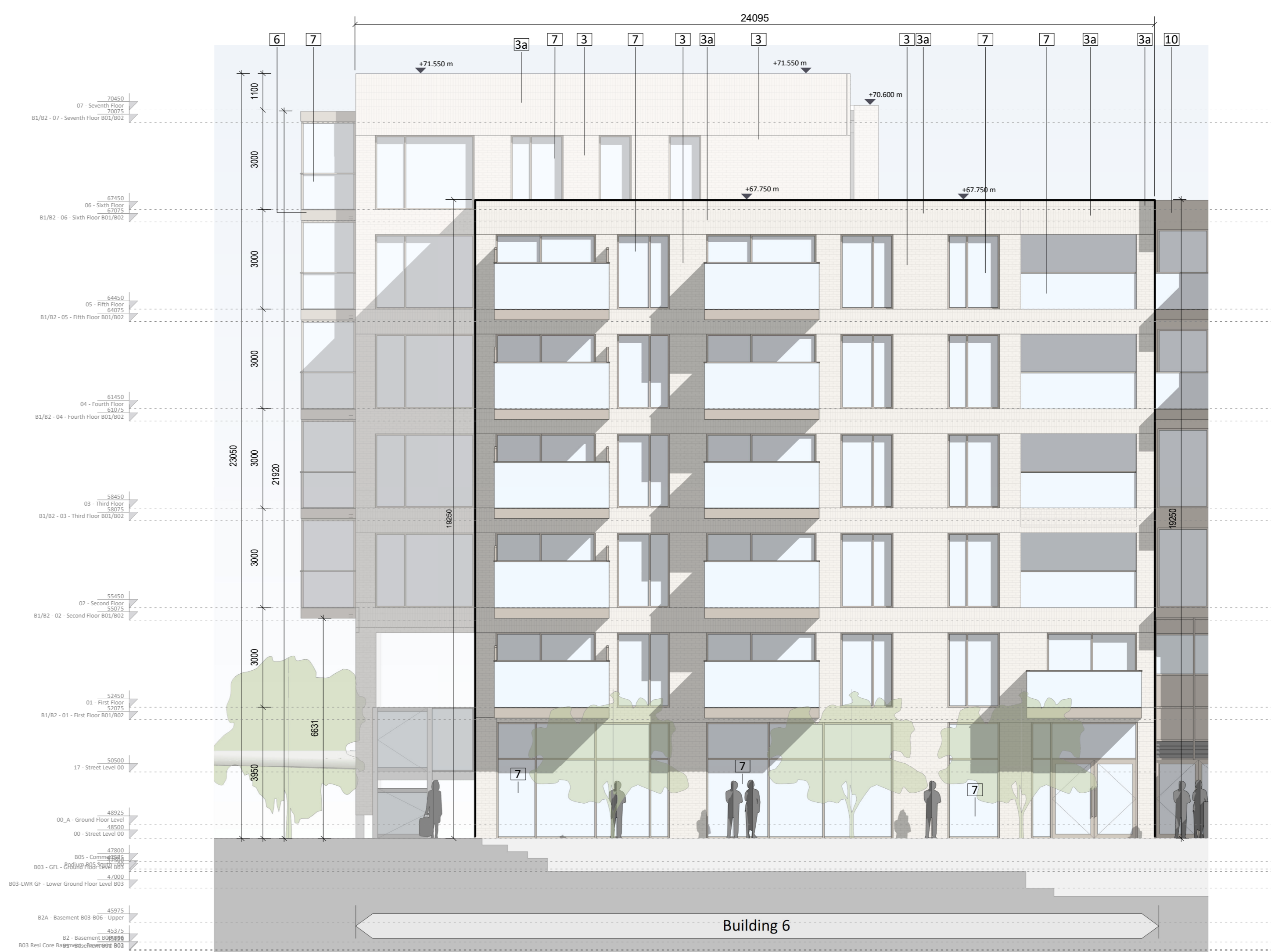
4 Building 06 - SE Elevation - Courtyard Elevation 1:100