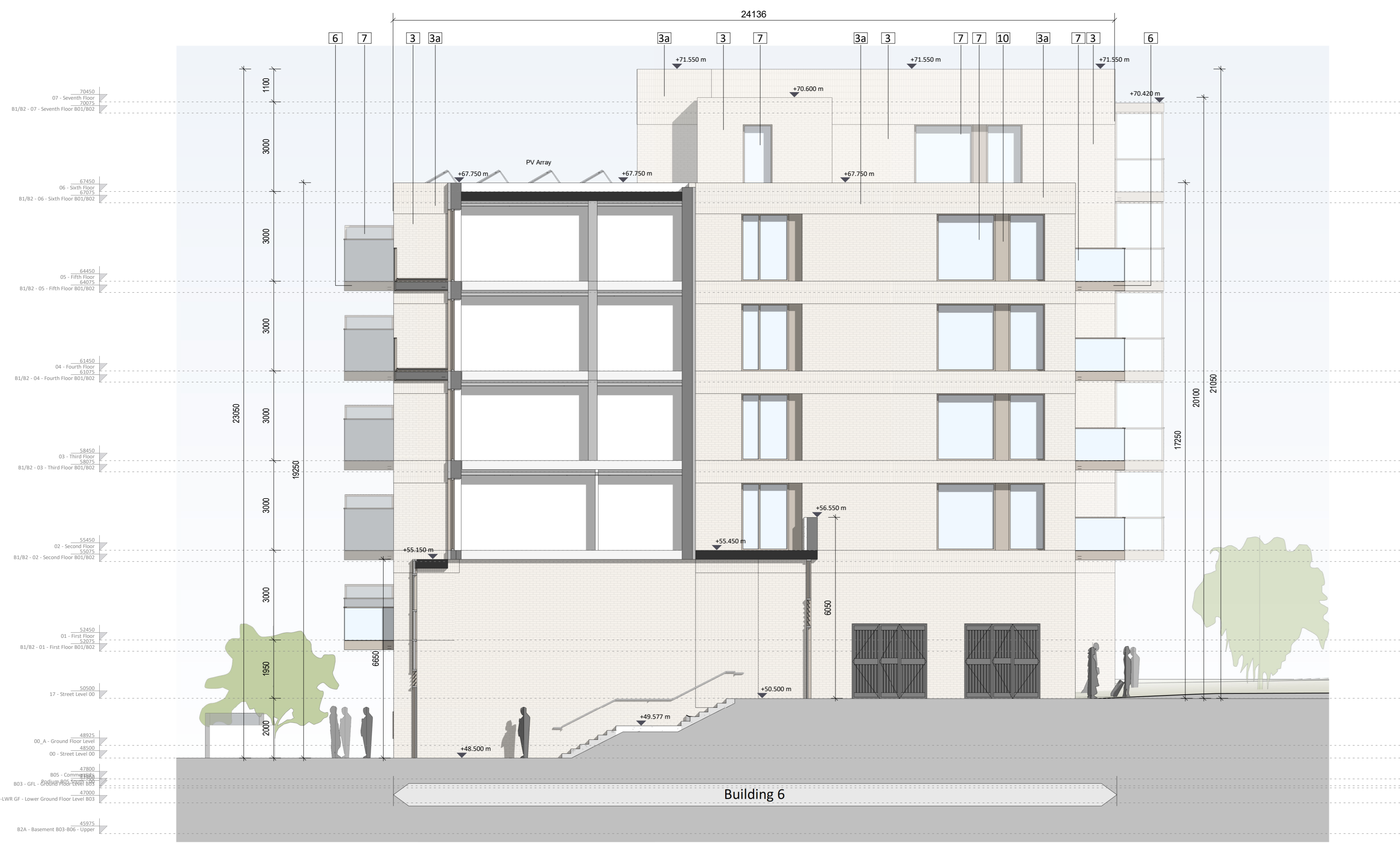
1 Building 06 - SE Elevation 1:100