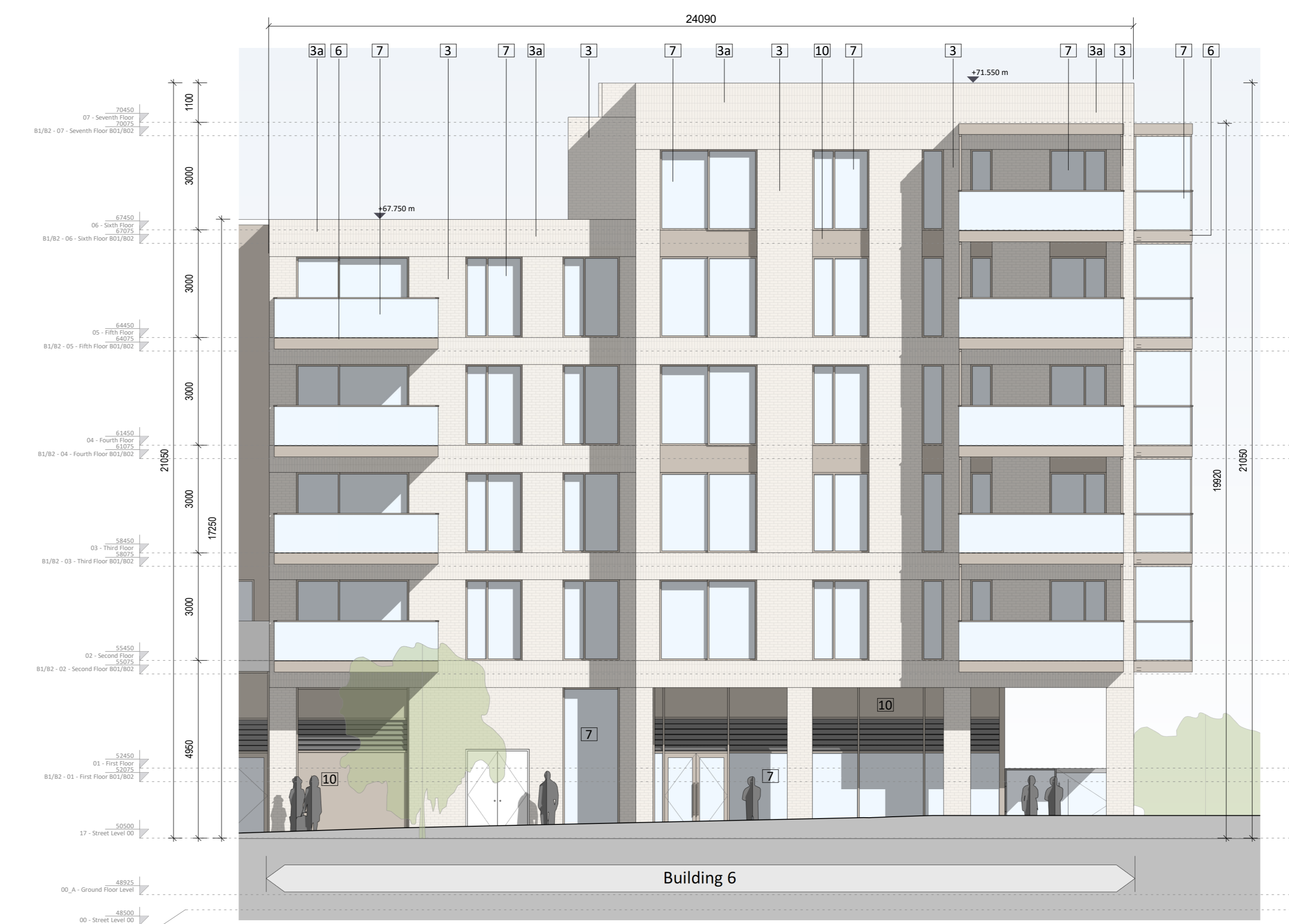
3 Building 06 - NE Elevation - Kilmacud Road 1:100