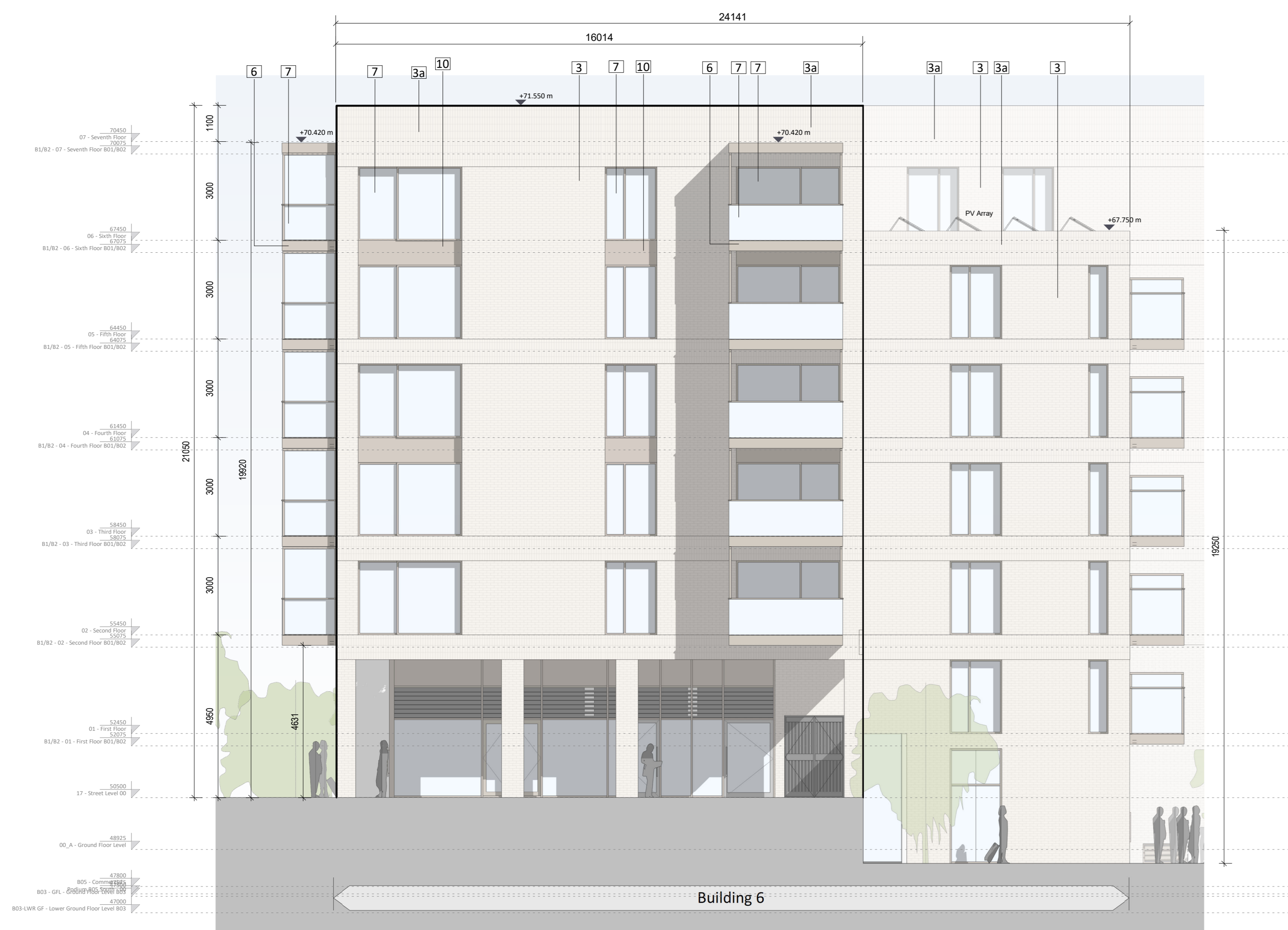
2 Building 06 - SW Elevation - The Hill 1:100