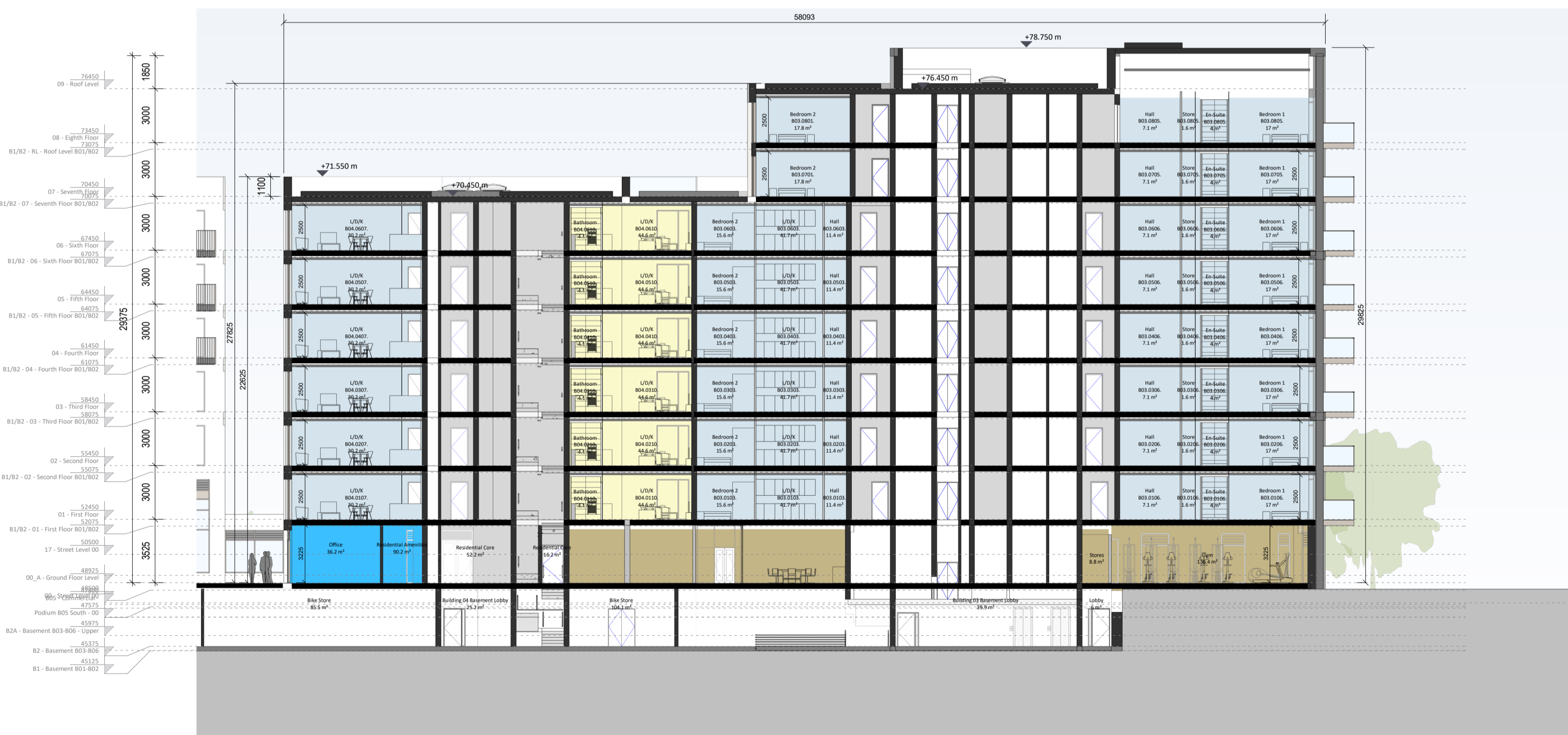
1 Section - Block 03&04 1:200