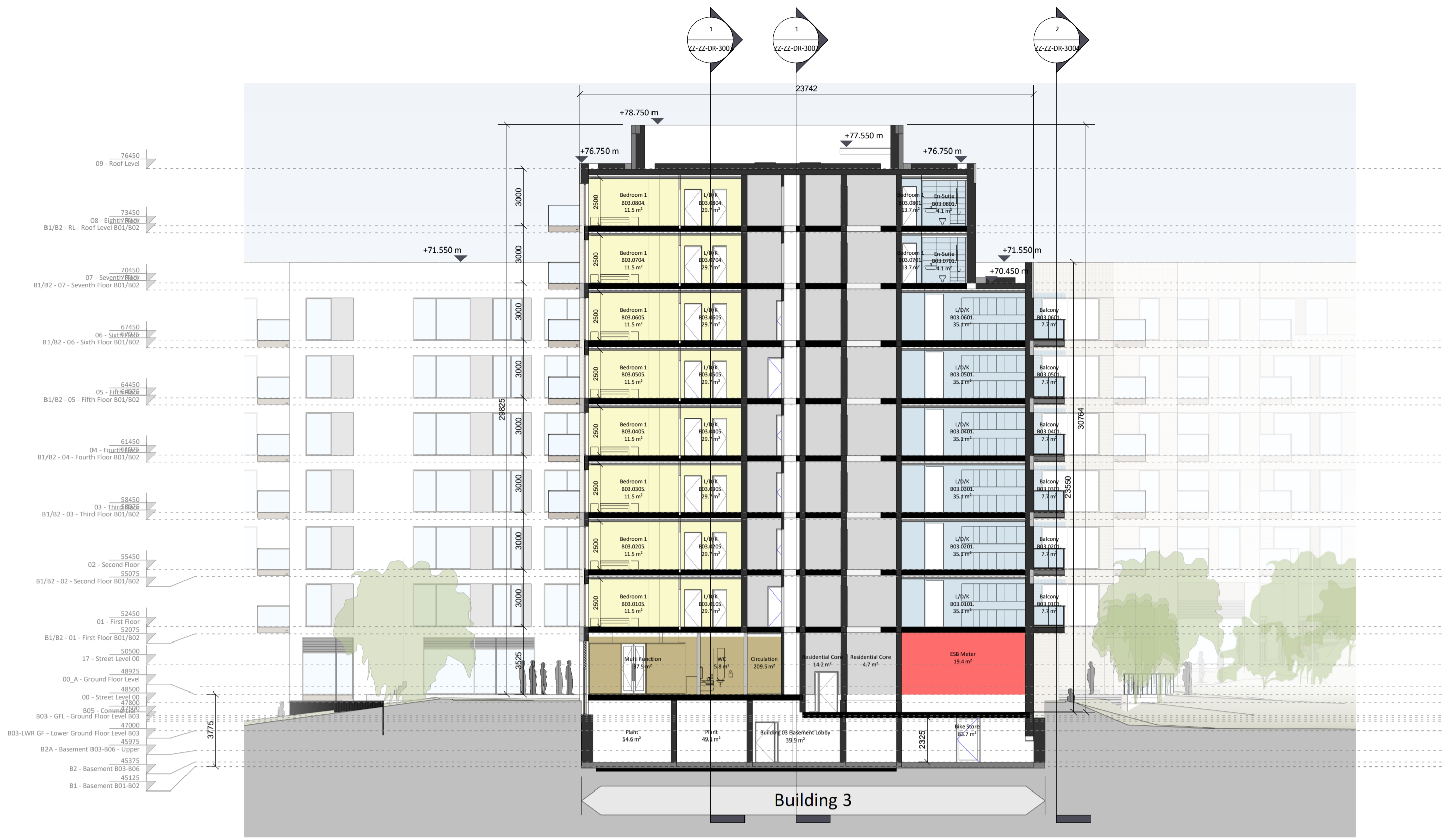
3 Building 03 - Cross Section N/S 1:200