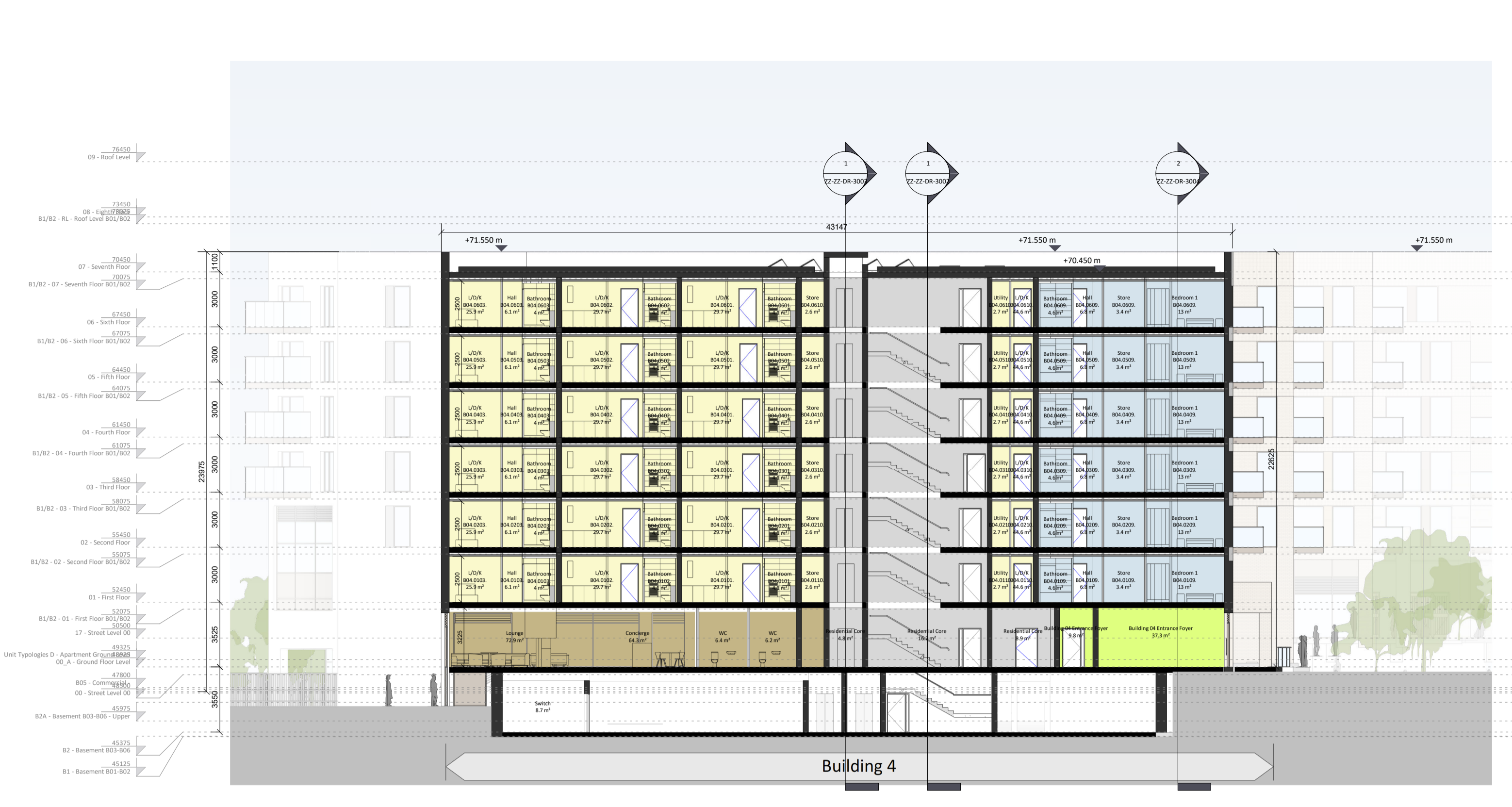
2 Building 04 - Cross Section N/S 1:200