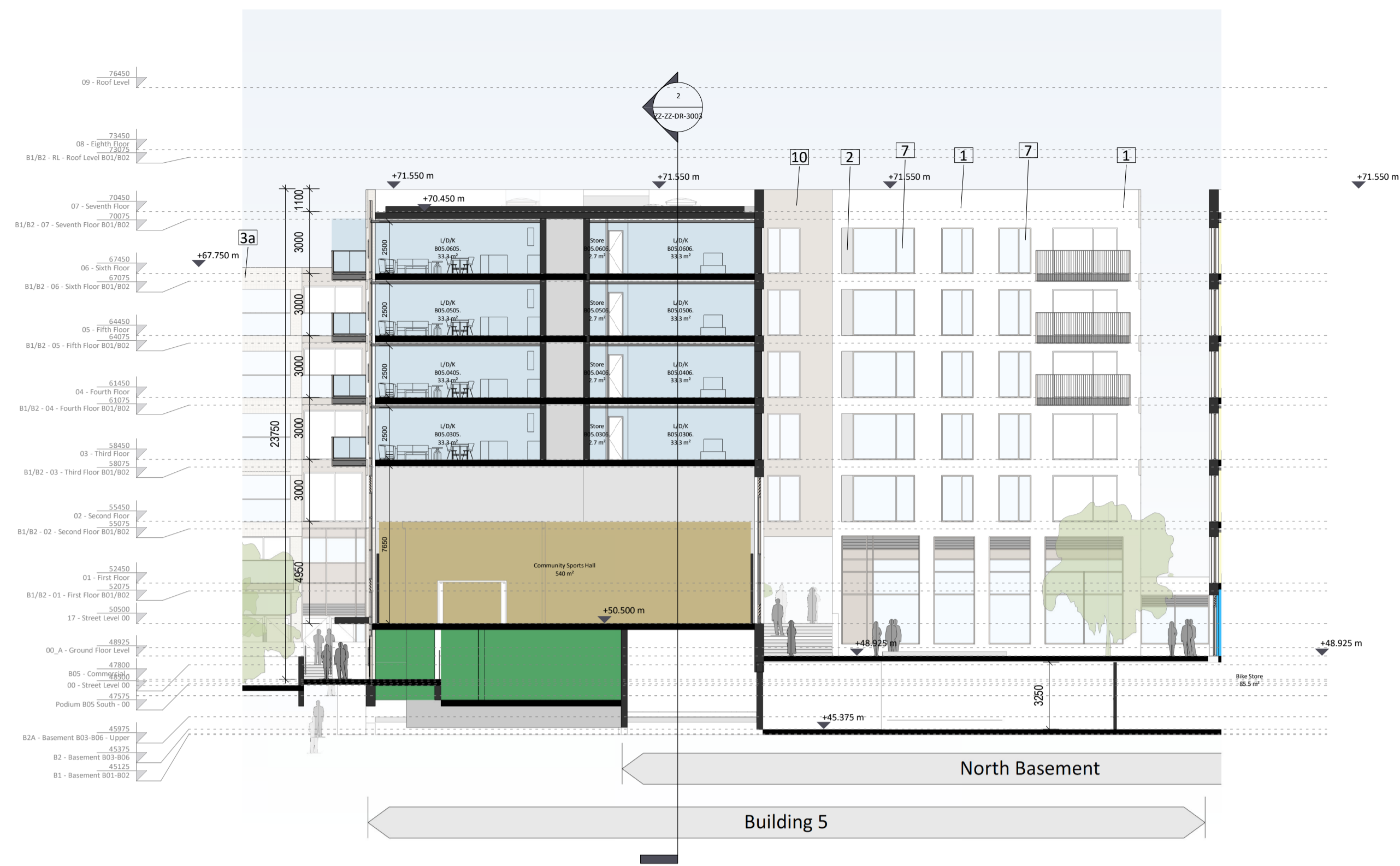
1 Building 05 - Cross Section 01 1 : 200