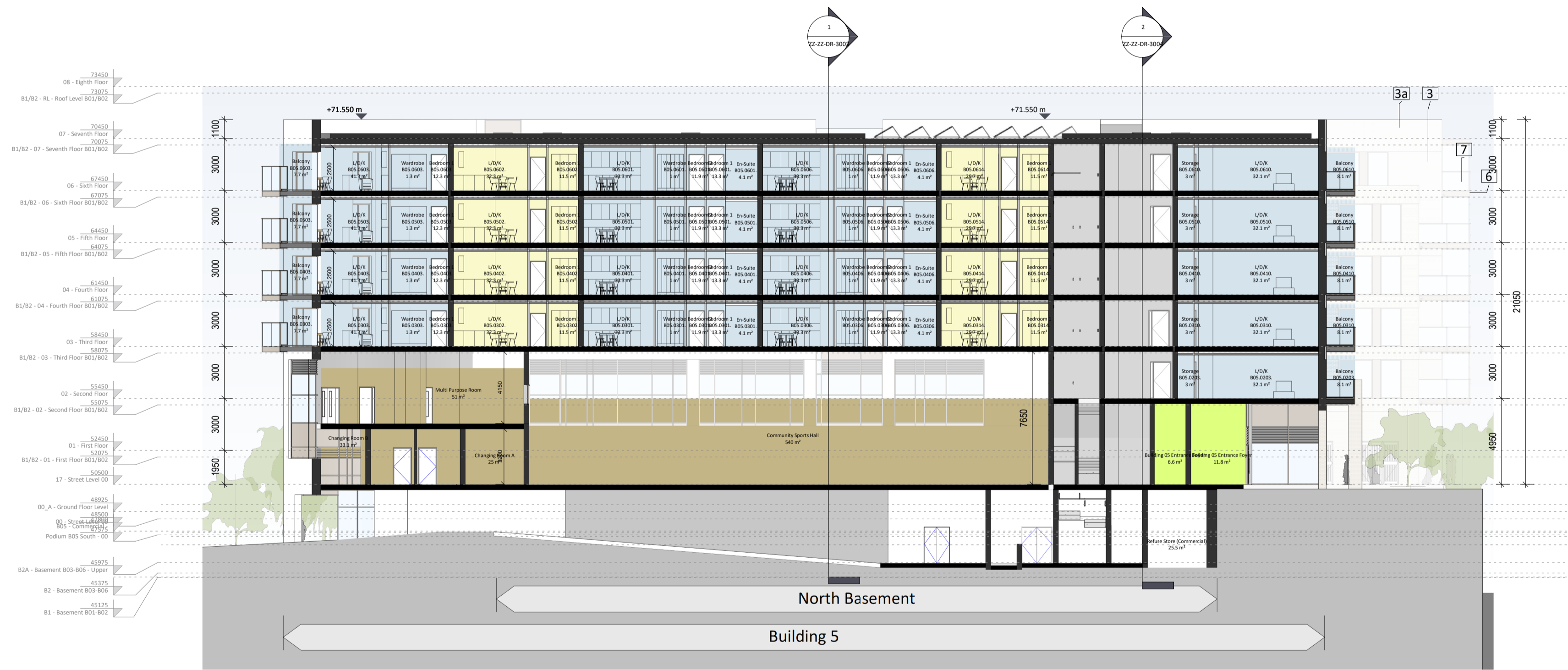
2 Building 05 - Cross Section 02 1 : 200