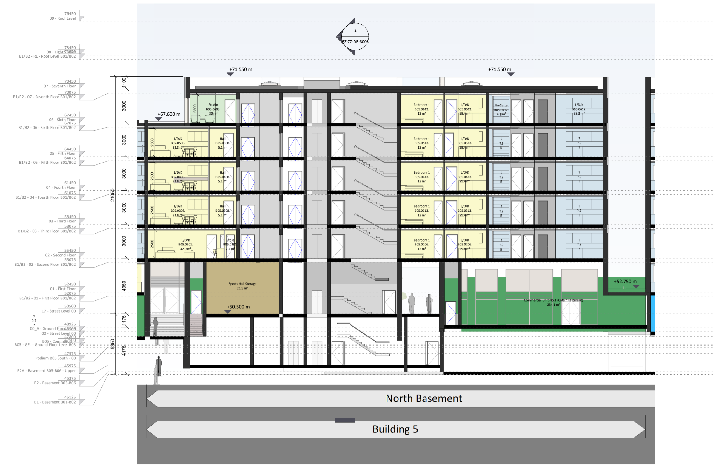
3 Section - Block 05 - Cross Section C 1 : 200