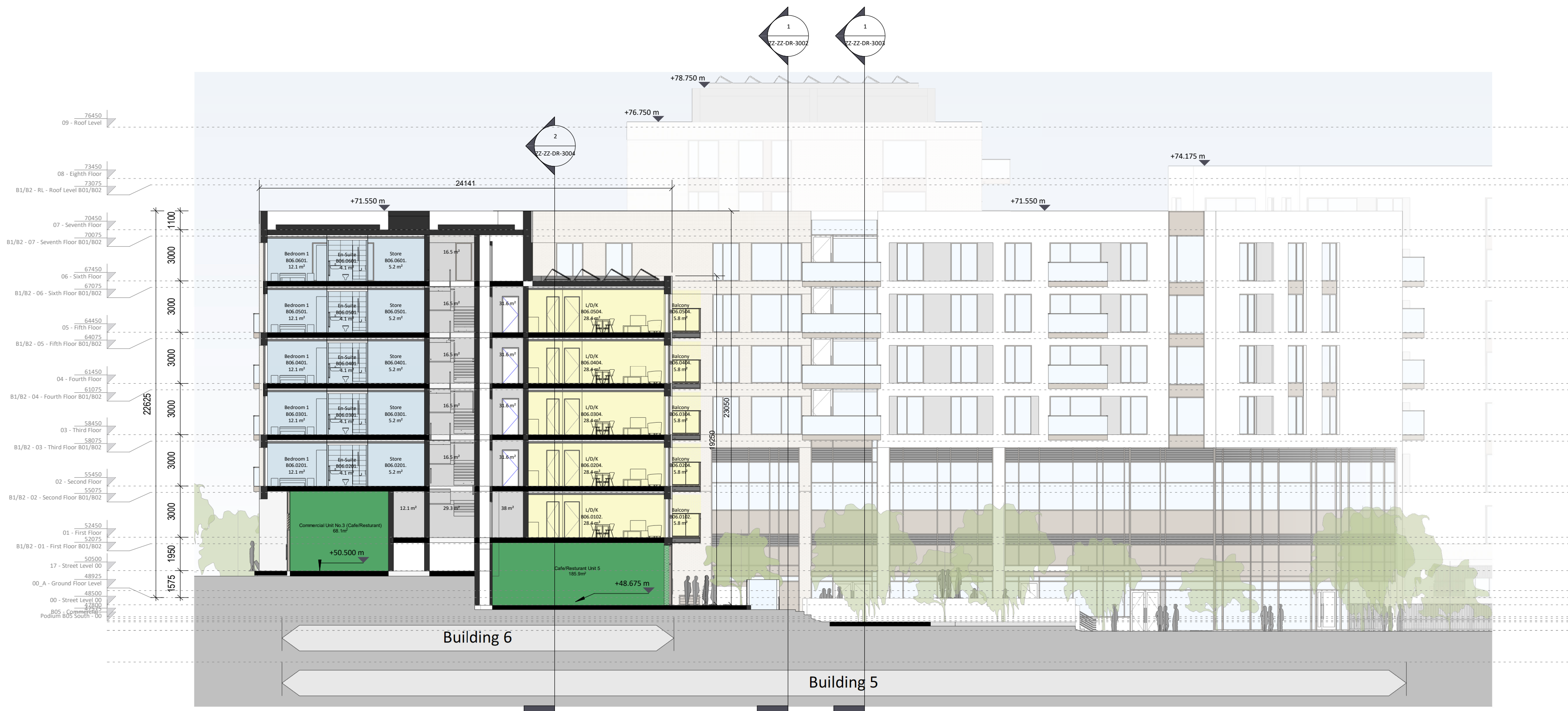
① Building 06 Section North/South 1:200