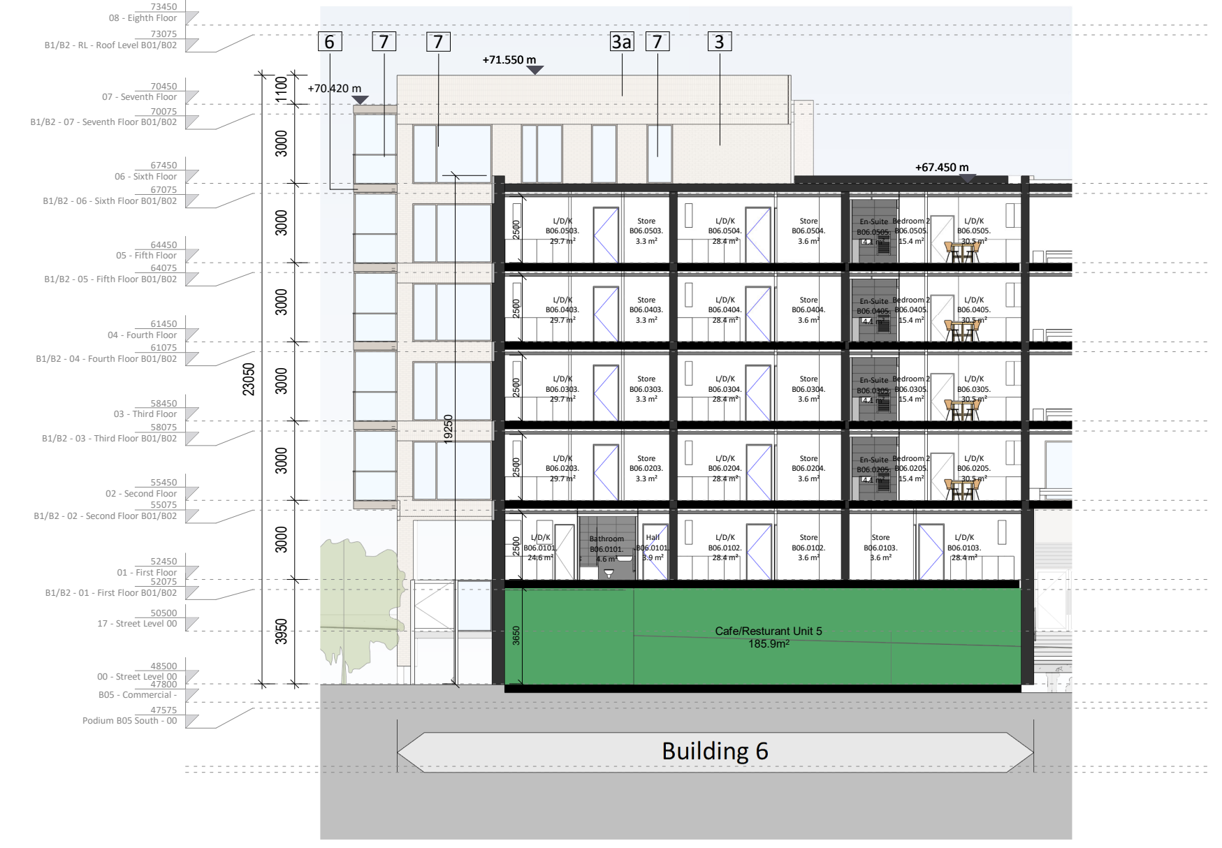
② Section - Block 06 - Cross Section A 1:200